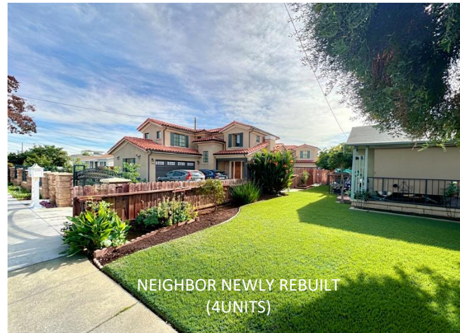
NEIGHBOR NEWLY REBUILT (4UNITS)