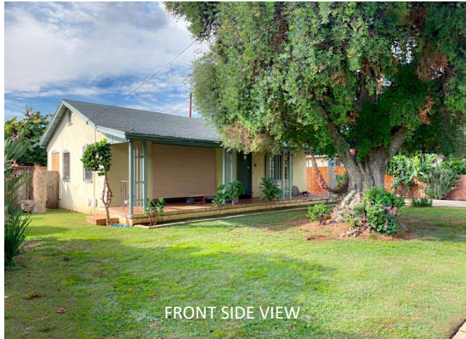
FRONT SIDE VIEW