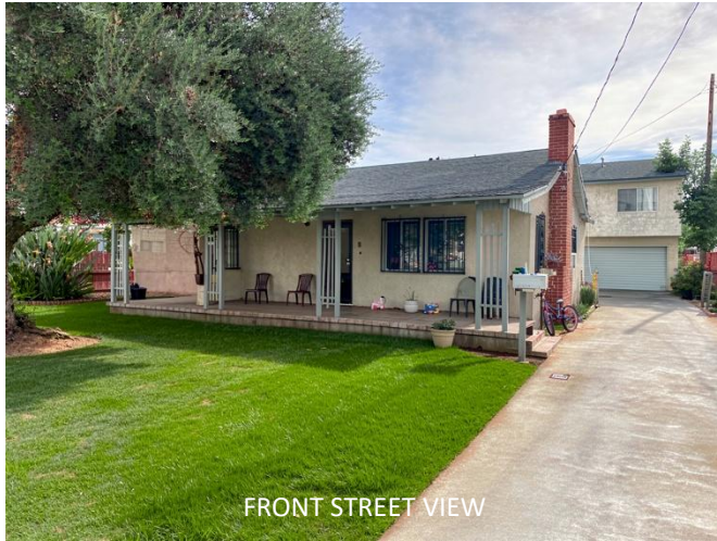
FRONT STREET VIEW