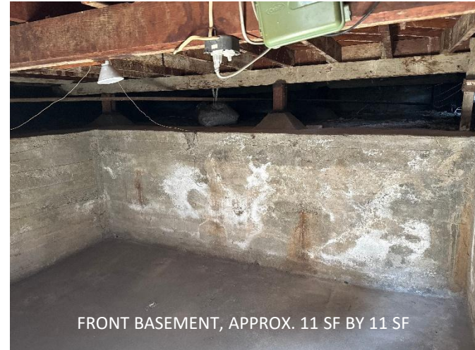
FRONT BASEMENT, APPROX. 11 SF BY 11 SF