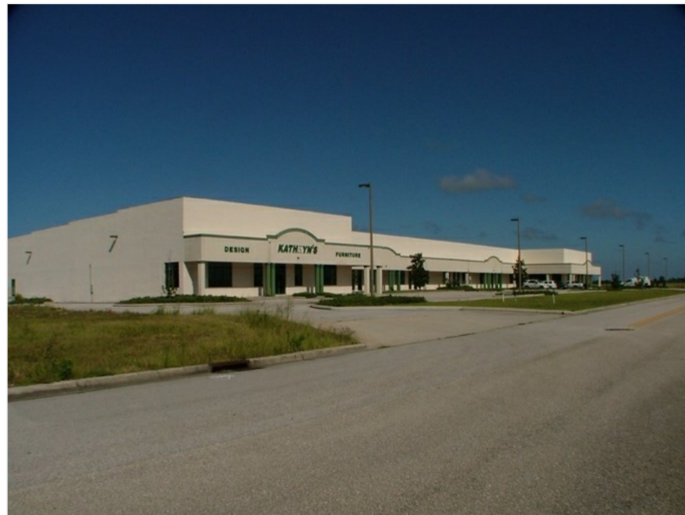
Front exterior 2