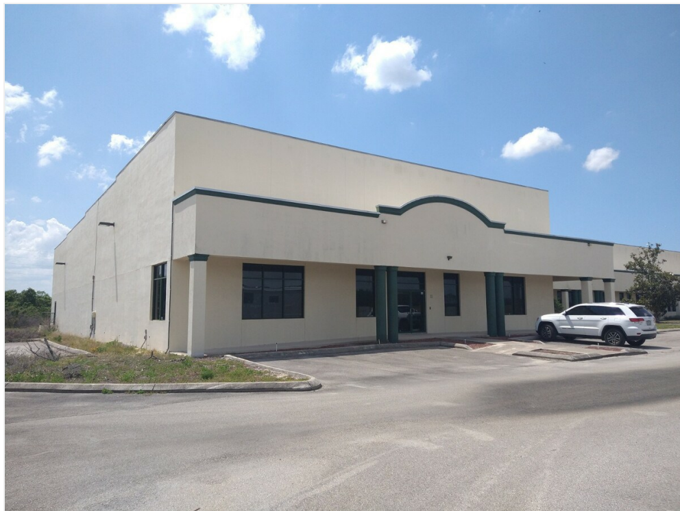
Front exterior 1