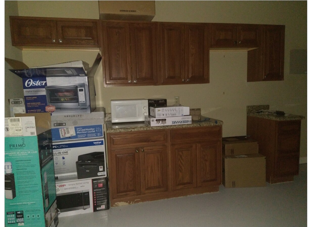
Rear break room in warehouse