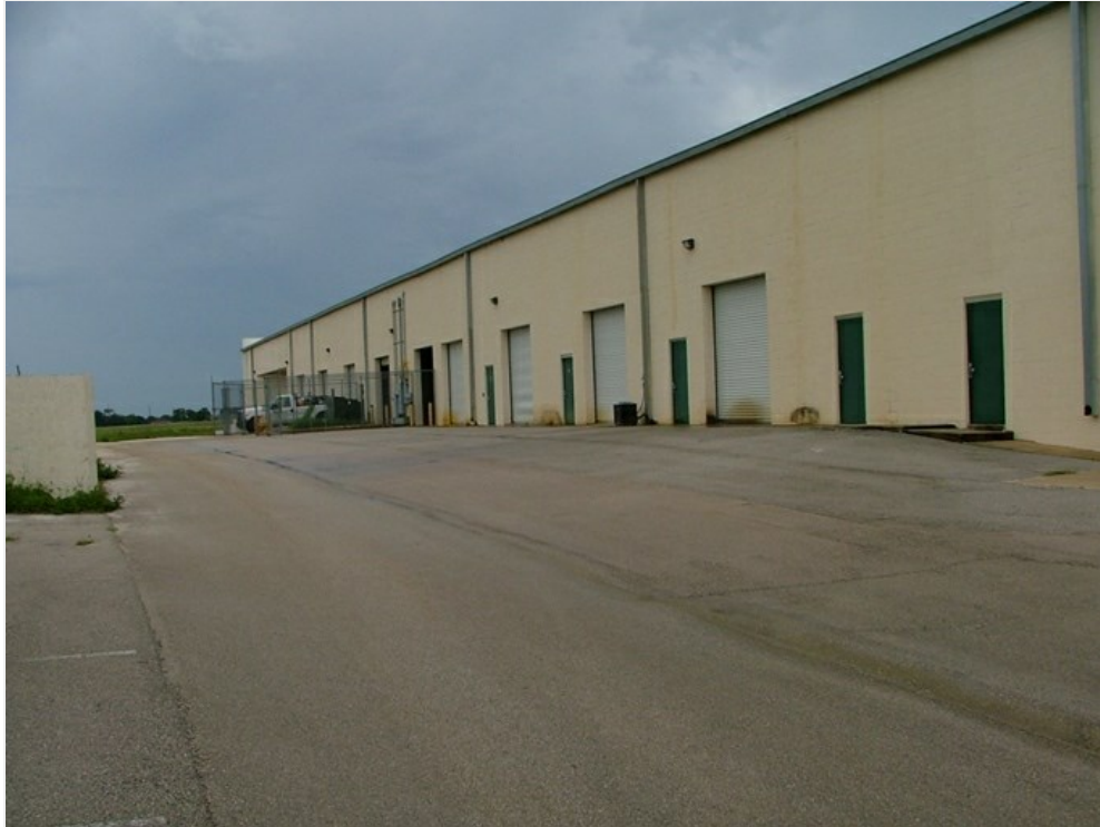
Rear building 1