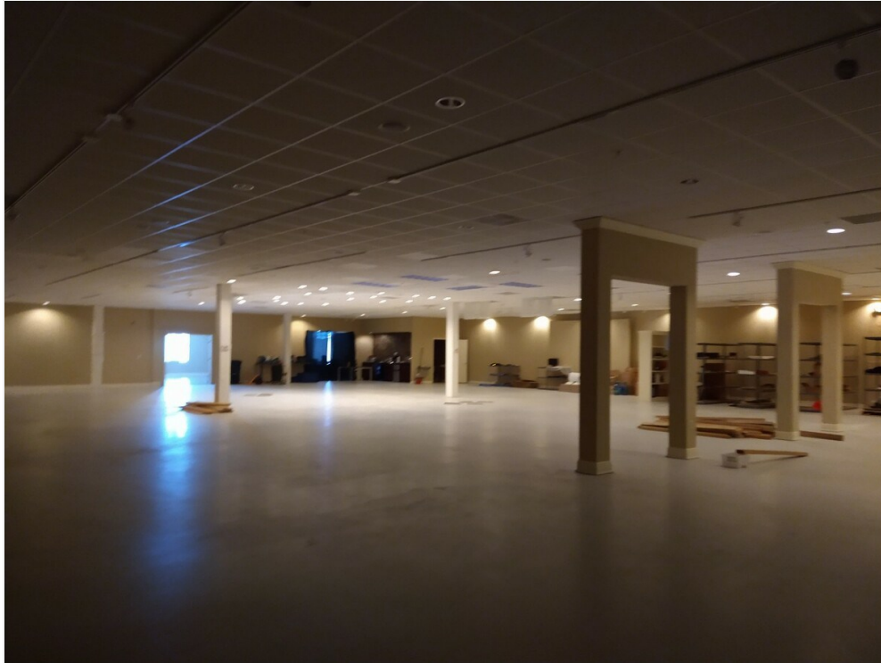
Current buildout. Remove ceiling tiles for 21' warehouse ceilings