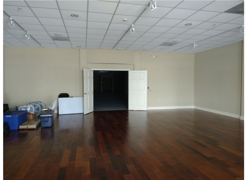
Front office entrance