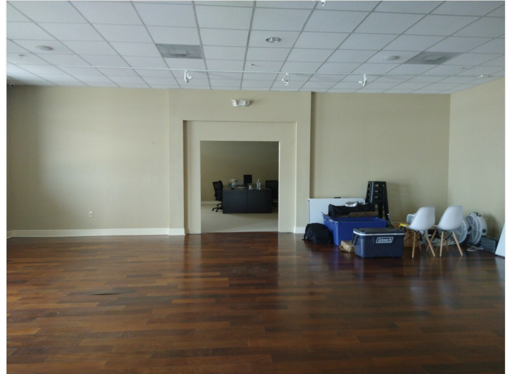
Main entrance to conference room