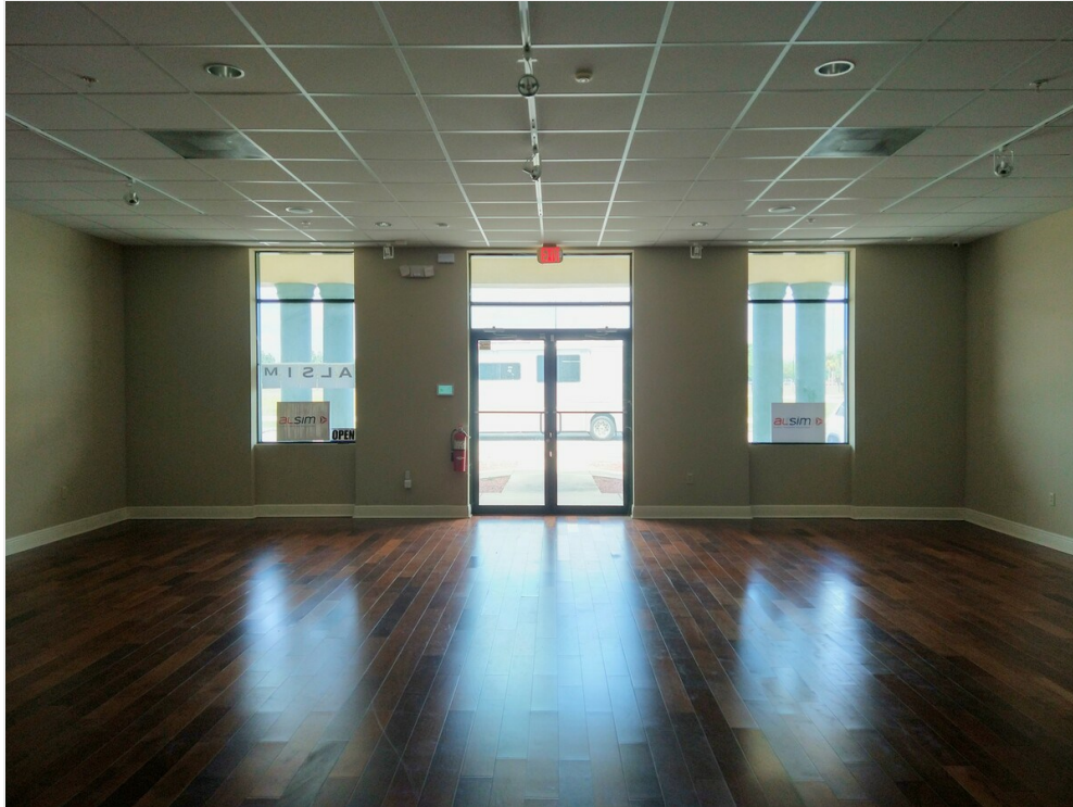
Front office entrance 2