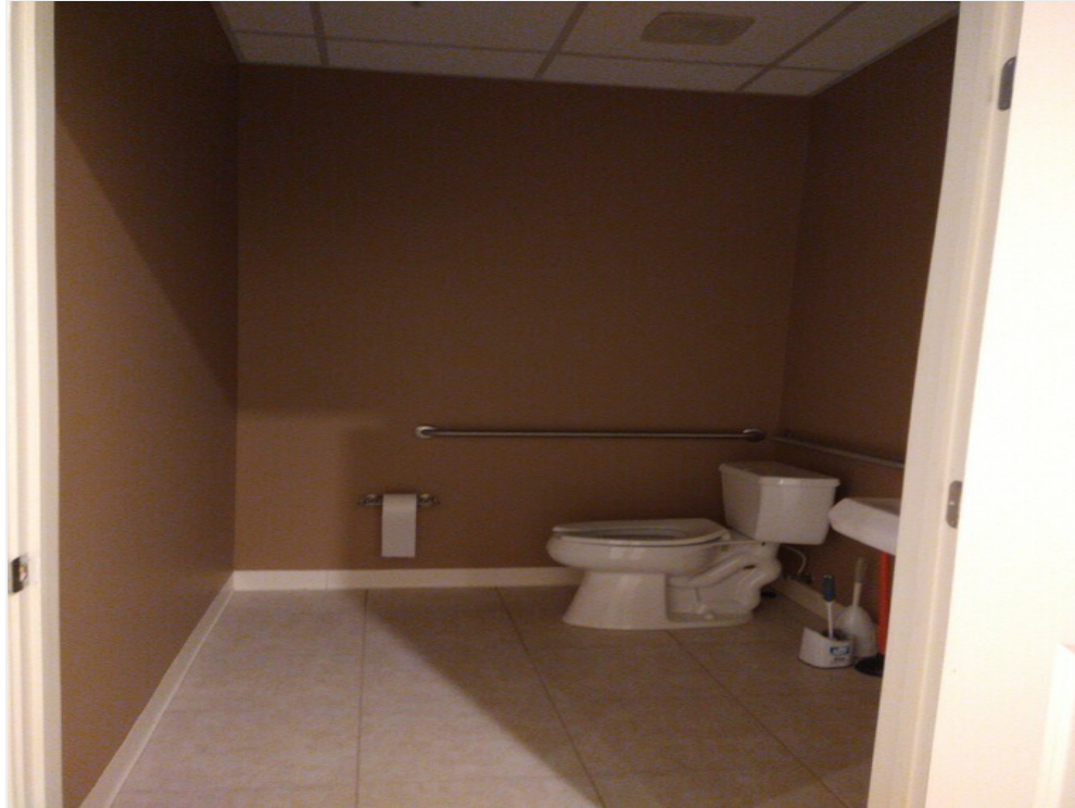
Bathroom 2 in warehouse