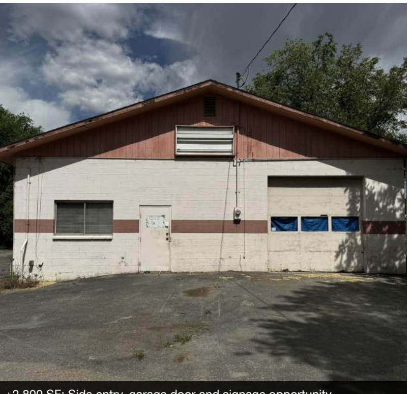
±2,800 SF: Side entry, garage door and signage opportunity