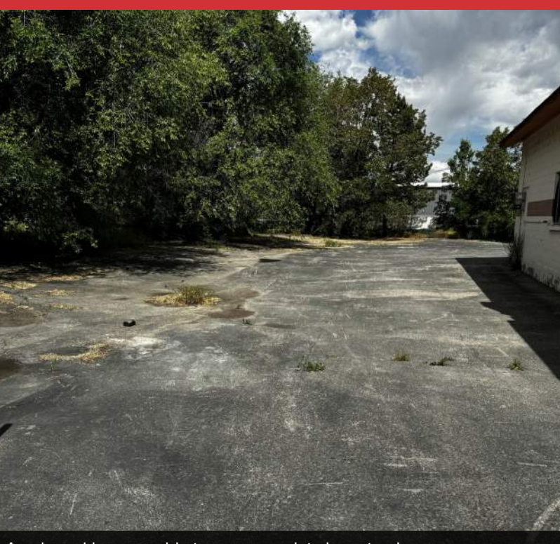
Ample parking area able to accommodate large trucks