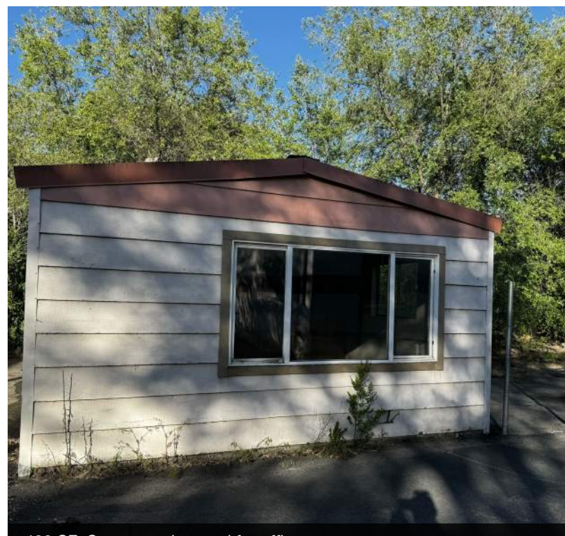
±400 SF: Space can be used for office

5571 N. Glenwood St. Boise, ID 83714 208 229 2020 tel naiselect.com