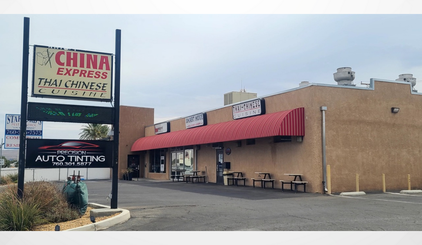
Year built 1962 | Year renovated 2010 Building size 7,416sf | Lot size 22,500sf(.52acres) 24 parking spaces