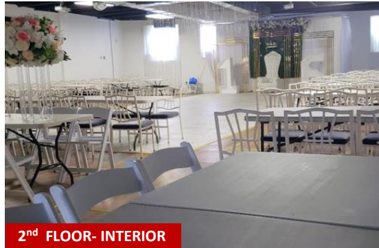
2 nd FLOOR- INTERIOR