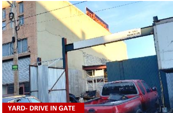
YARD- DRIVE IN GATE