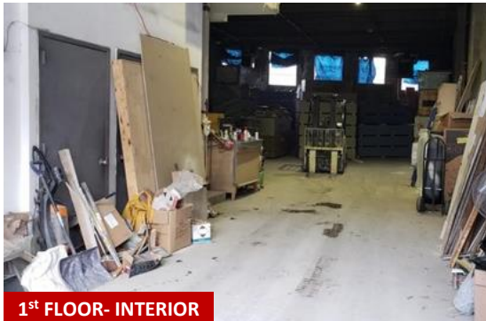
1 st FLOOR- INTERIOR