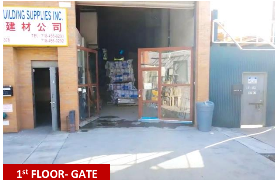
1 st FLOOR- GATE