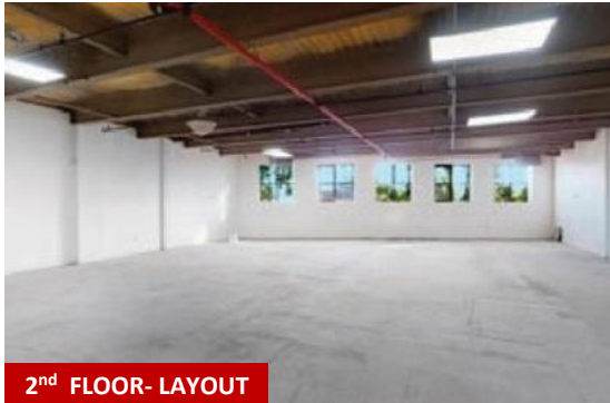
2 nd FLOOR- LAYOUT