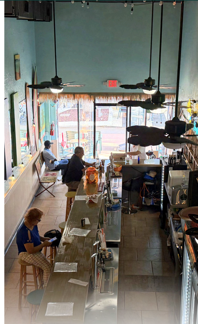
625 LINCOLN ROAD