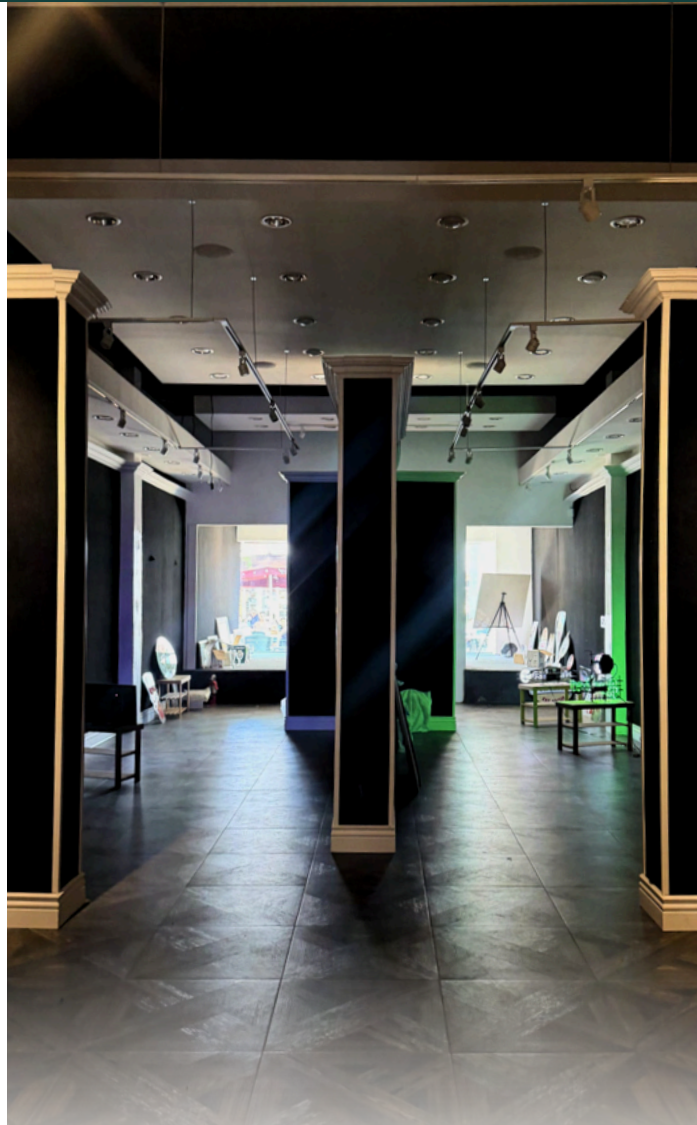
629 LINCOLN ROAD