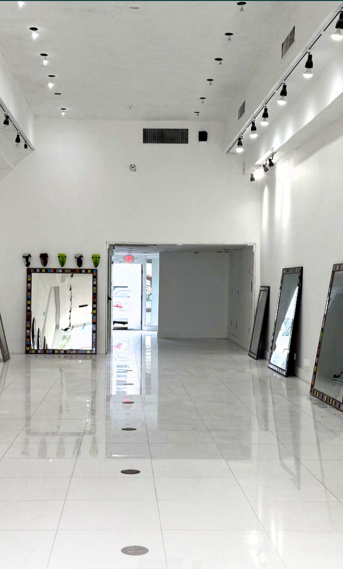
631 LINCOLN ROAD