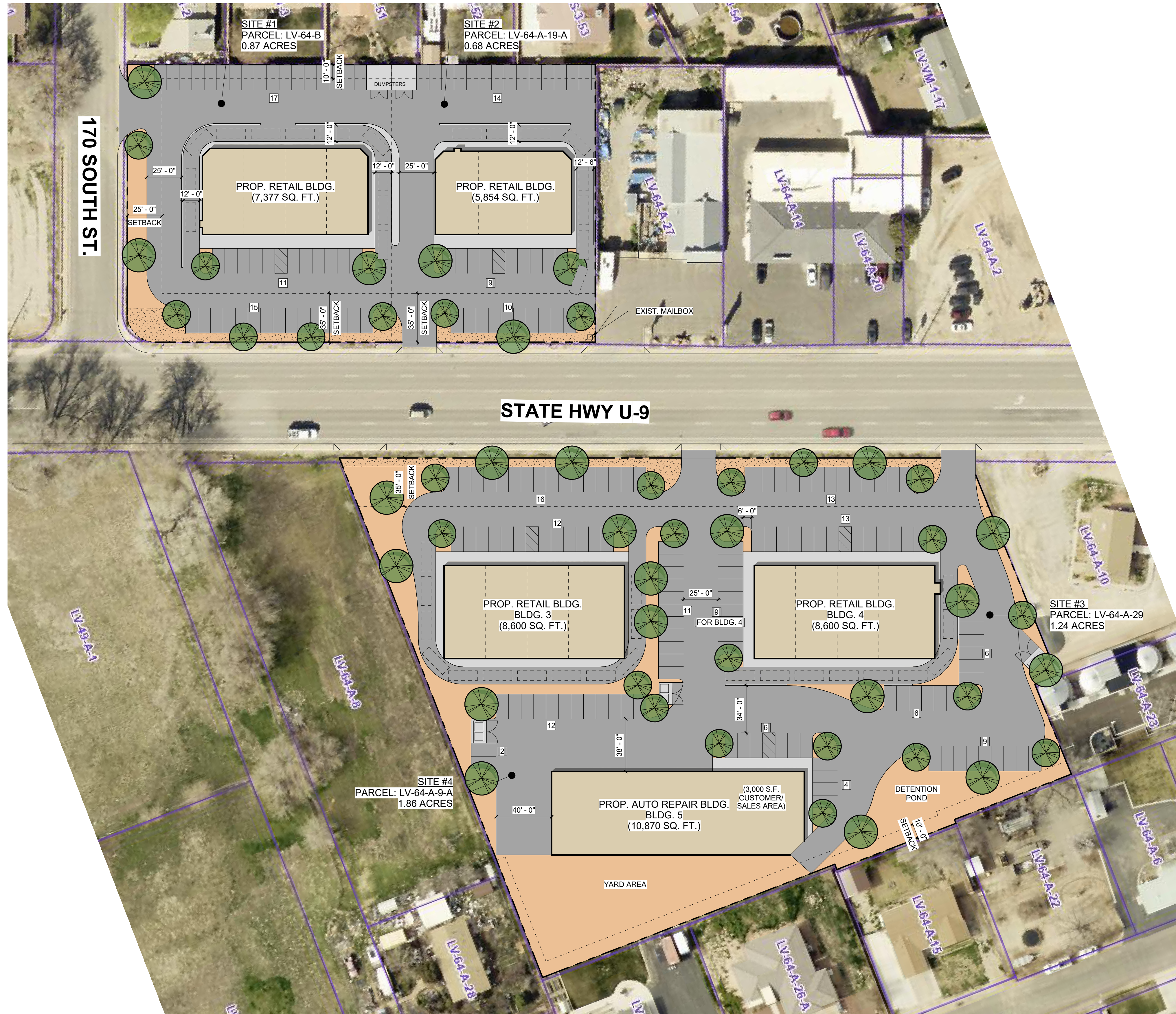
OPTION D - OVERALL ARCHITECTURAL SITE PLAN