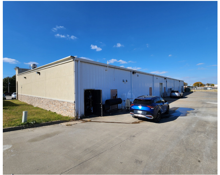
BUILDING SIDE AND BACK ENTRANCE