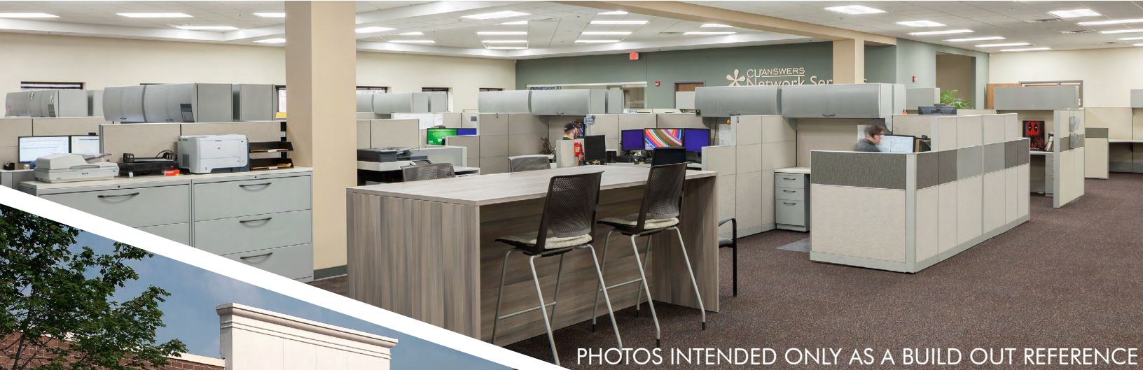
PHOTOS INTENDED ONLY AS A BUILD OUT REFERENCE

4665 44TH STREET SE | GRAND RAPIDS, MI 49512