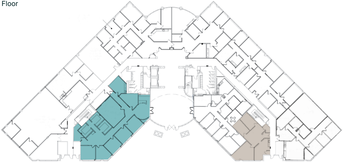
Suite 112 3,632 SF Available November 2026