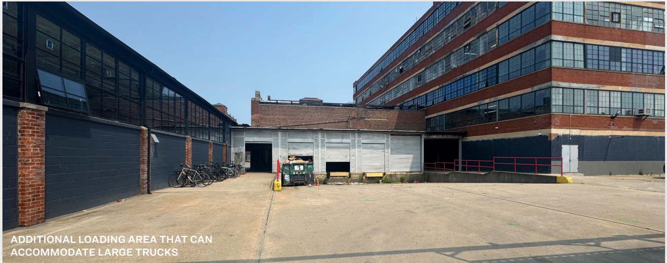
ADDITIONAL LOADING AREA THAT CAN ACCOMMODATE LARGE TRUCKS