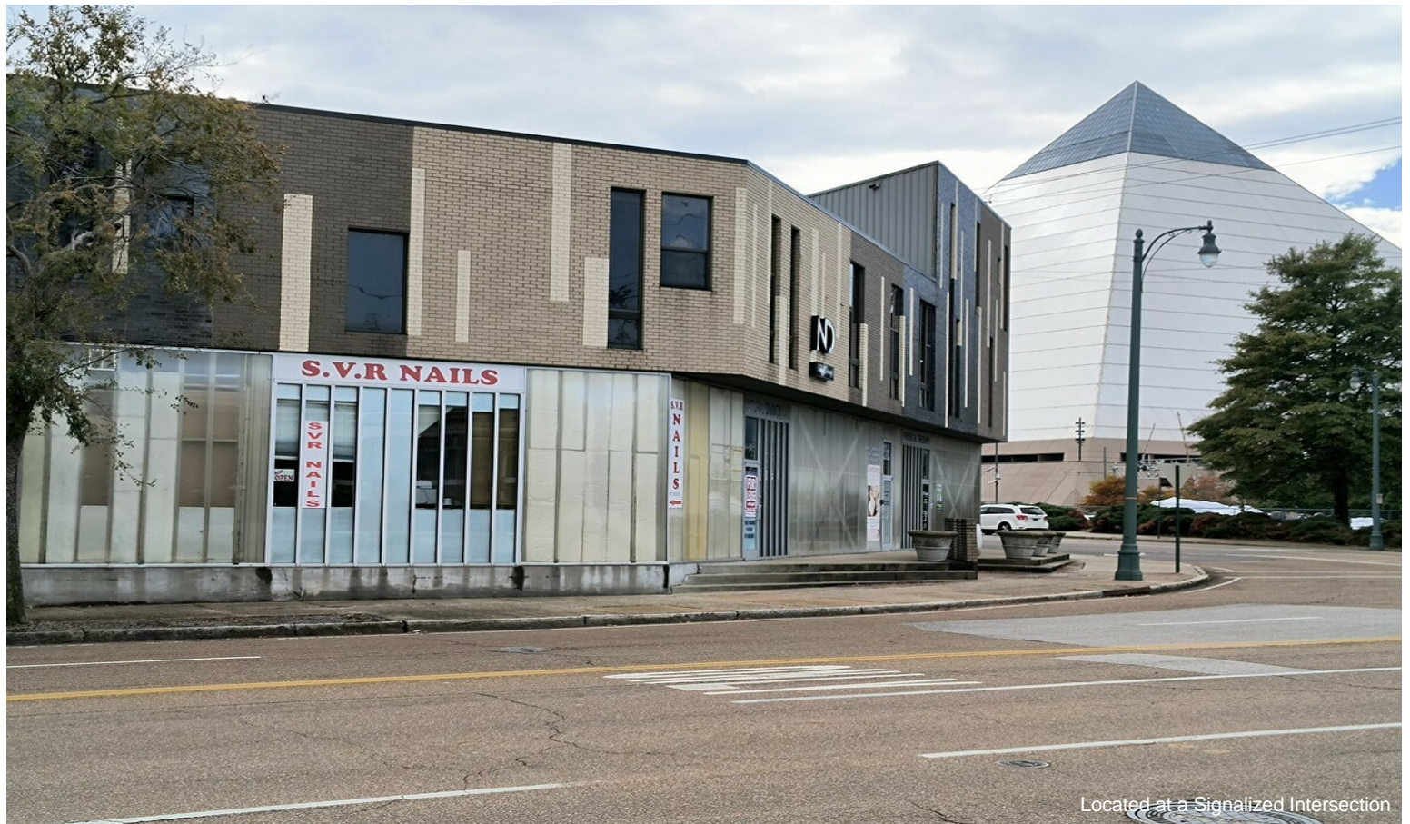
Located at a Signalized Intersection