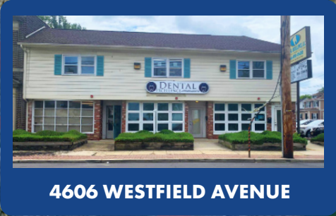
4606 WESTFIELD AVENUE