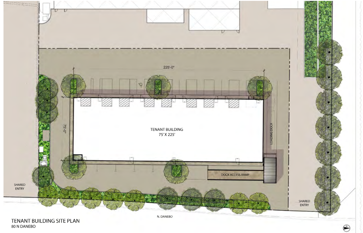
TENANT BUILDING SITE PLAN 80 N DANEBO