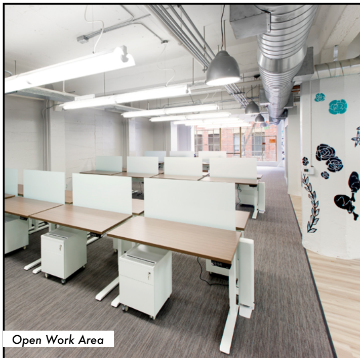
Open Work Area