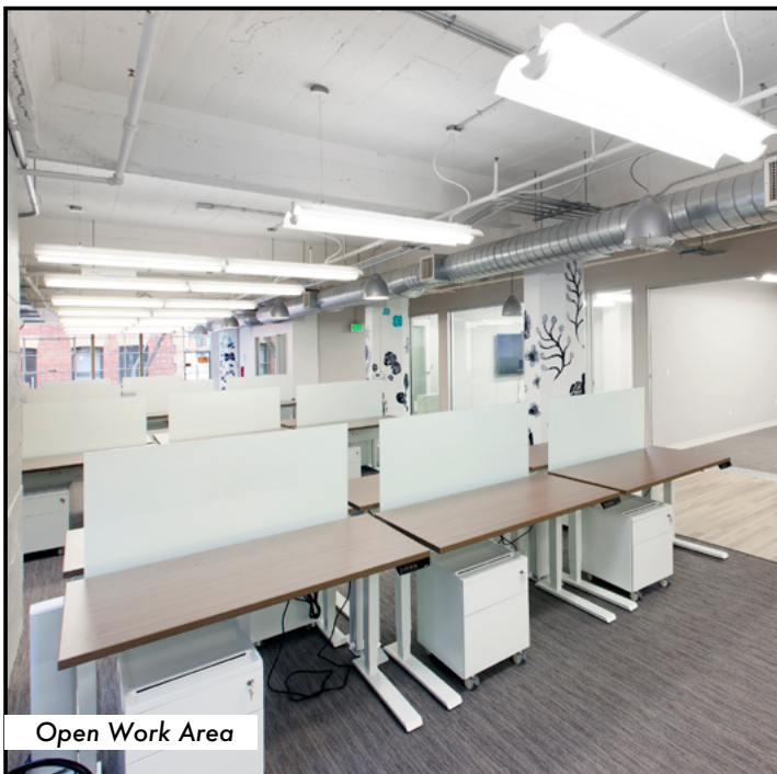
Open Work Area