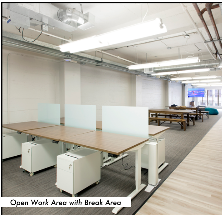
Open Work Area with Break Area