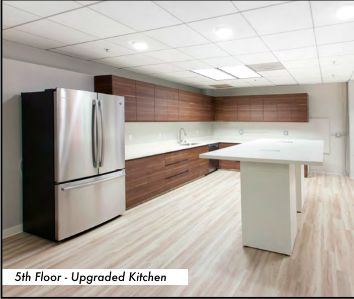
5th Floor - Upgraded Kitchen

611 MISSION STREET South Financial District