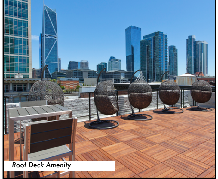
Roof Deck Amenity