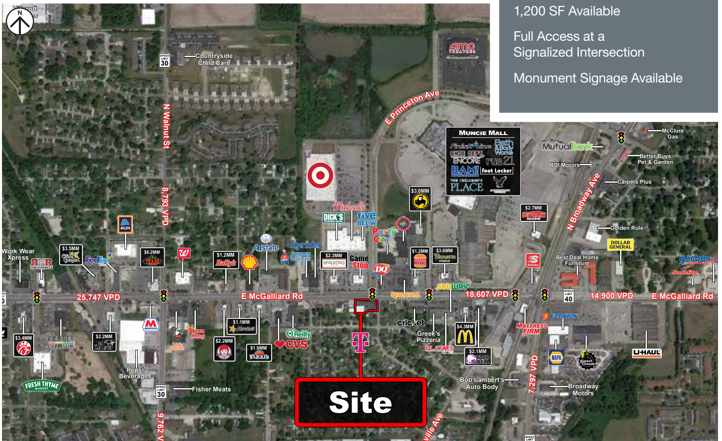
Sales Data Sourced from Restaurant Trends

1,200 SF Available Full Access at a Signalized Intersection Monument Signage Available