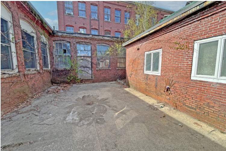
Private Back Patio