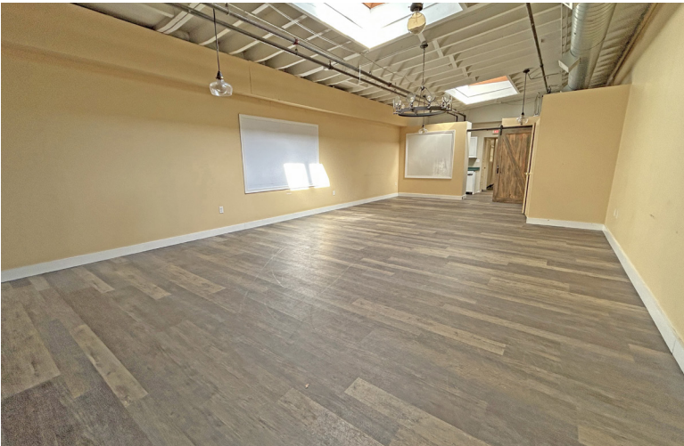
Large Conference Area