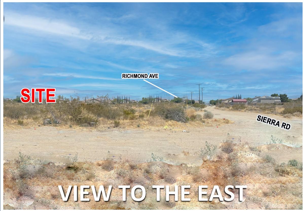
VIEW TO THE EAST