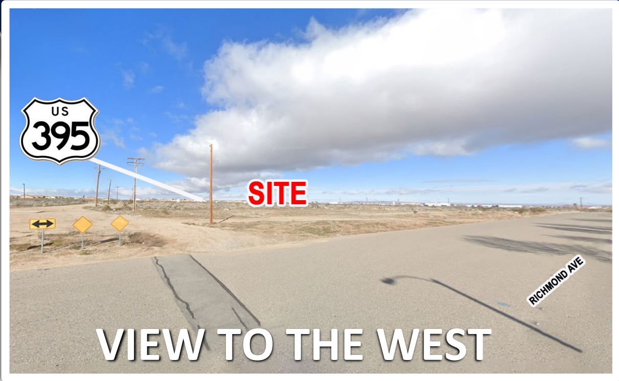
VIEW TO THE WEST