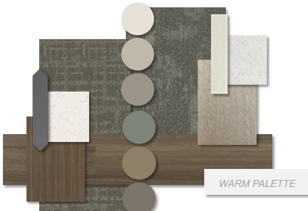
Suite Design Concepts