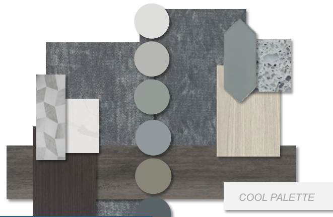
Suite Design Concepts