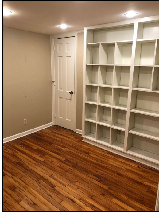
Ground Floor Office