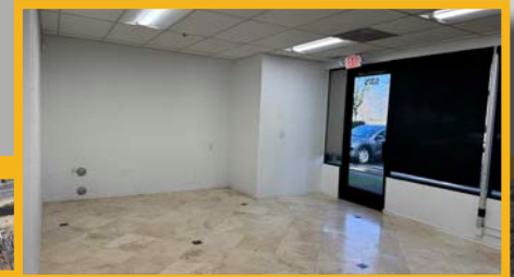
5375 Truxtun Avenue