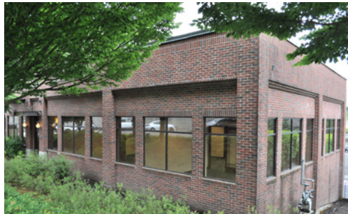
EXTERIOR OF SUITE 201