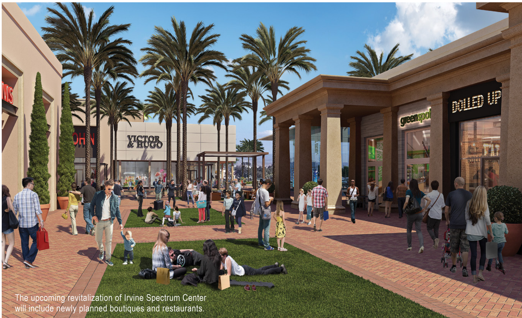
The upcoming revitalization of Irvine Spectrum Center will include newly planned boutiques and restaurants.