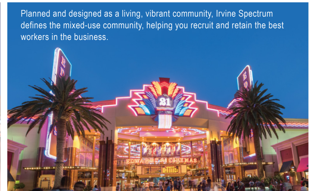
Planned and designed as a living, vibrant community, Irvine Spectrum defines the mixed-use community, helping you recruit and retain the best workers in the business.