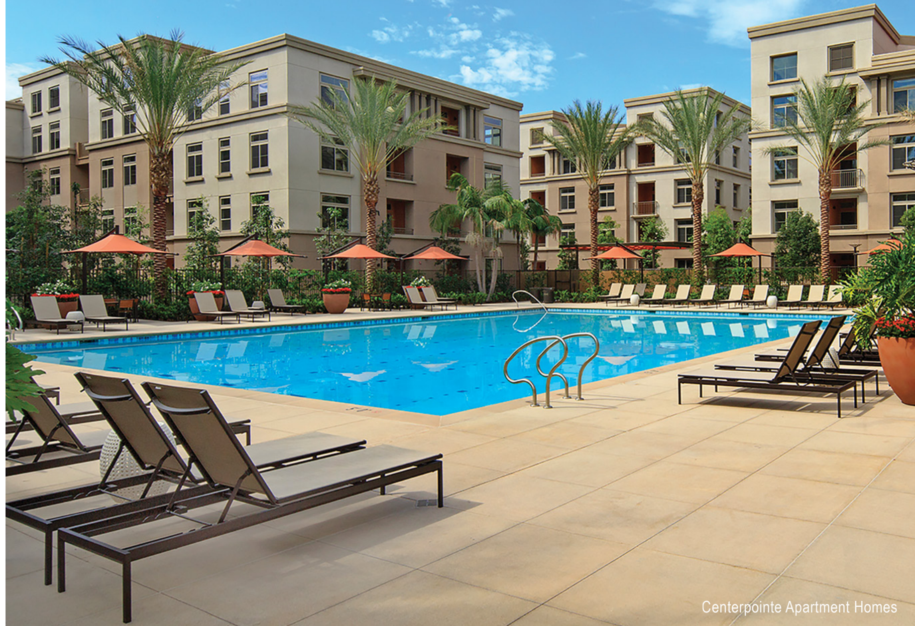
Centerpointe Apartment Homes

FOR THE 13TH YEAR, IRVINE IS AMONG THE NATION'S SAFEST CITIES