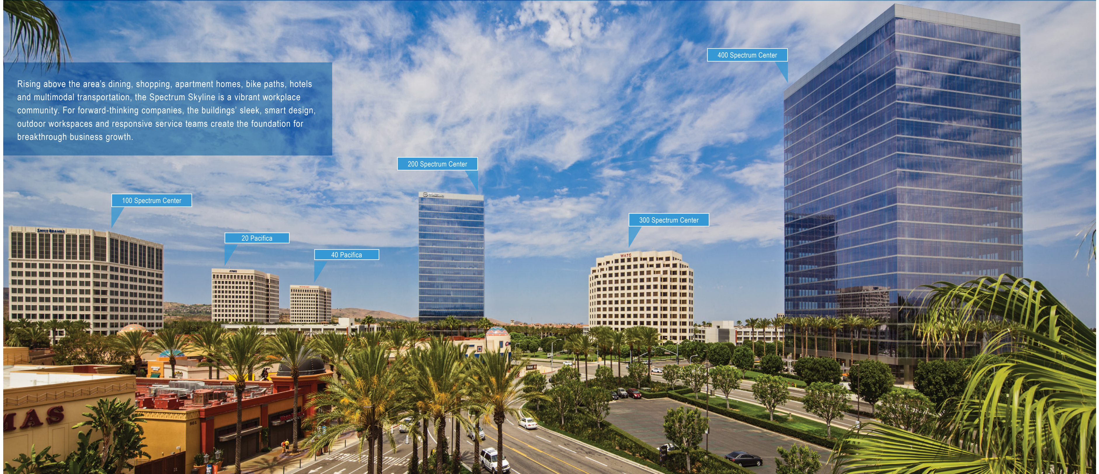
400 Spectrum Center