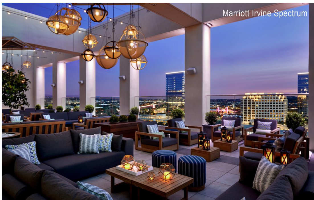
Marriott Irvine Spectrum