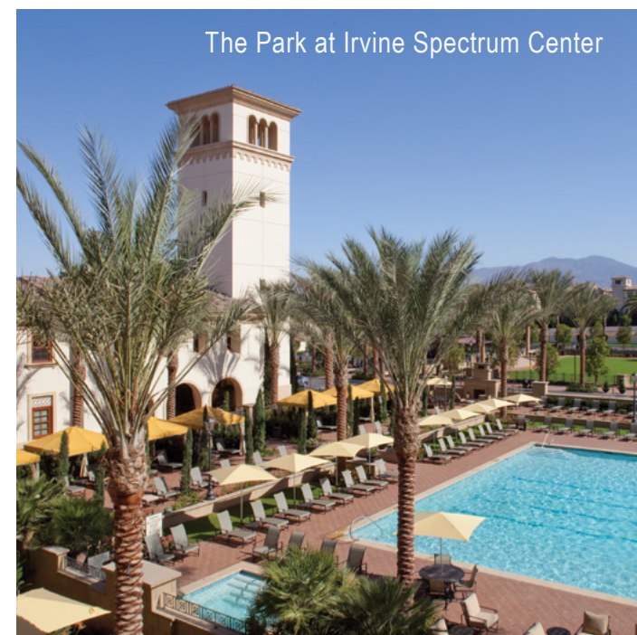
The Park at Irvine Spectrum Center