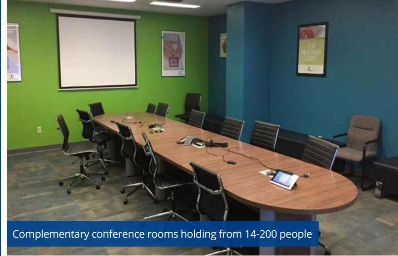
Complementary conference rooms holding from 14-200 people