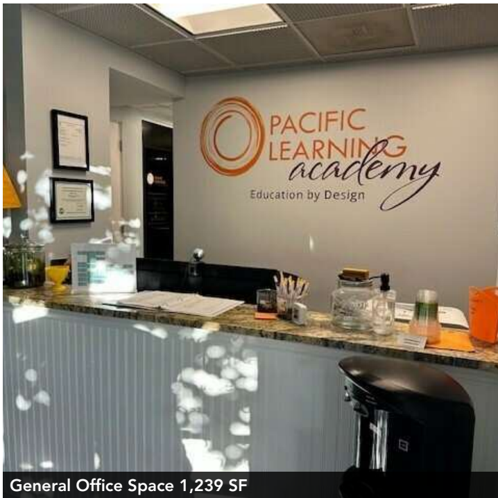
General Office Space 1,239 SF