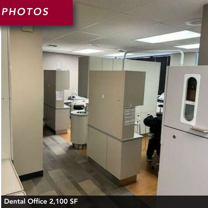
Dental Office 2,100 SF