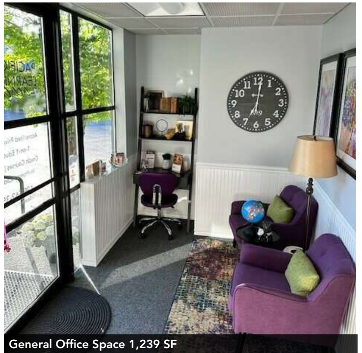
General Office Space 1,239 SF