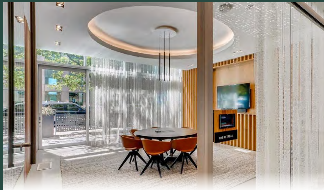
"The Retreat" Meeting Room

Gensler- designed, lively, modern, and inviting lobby areas at The 410