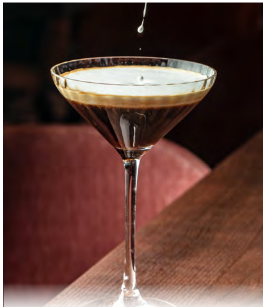
Cocktails + Vibes