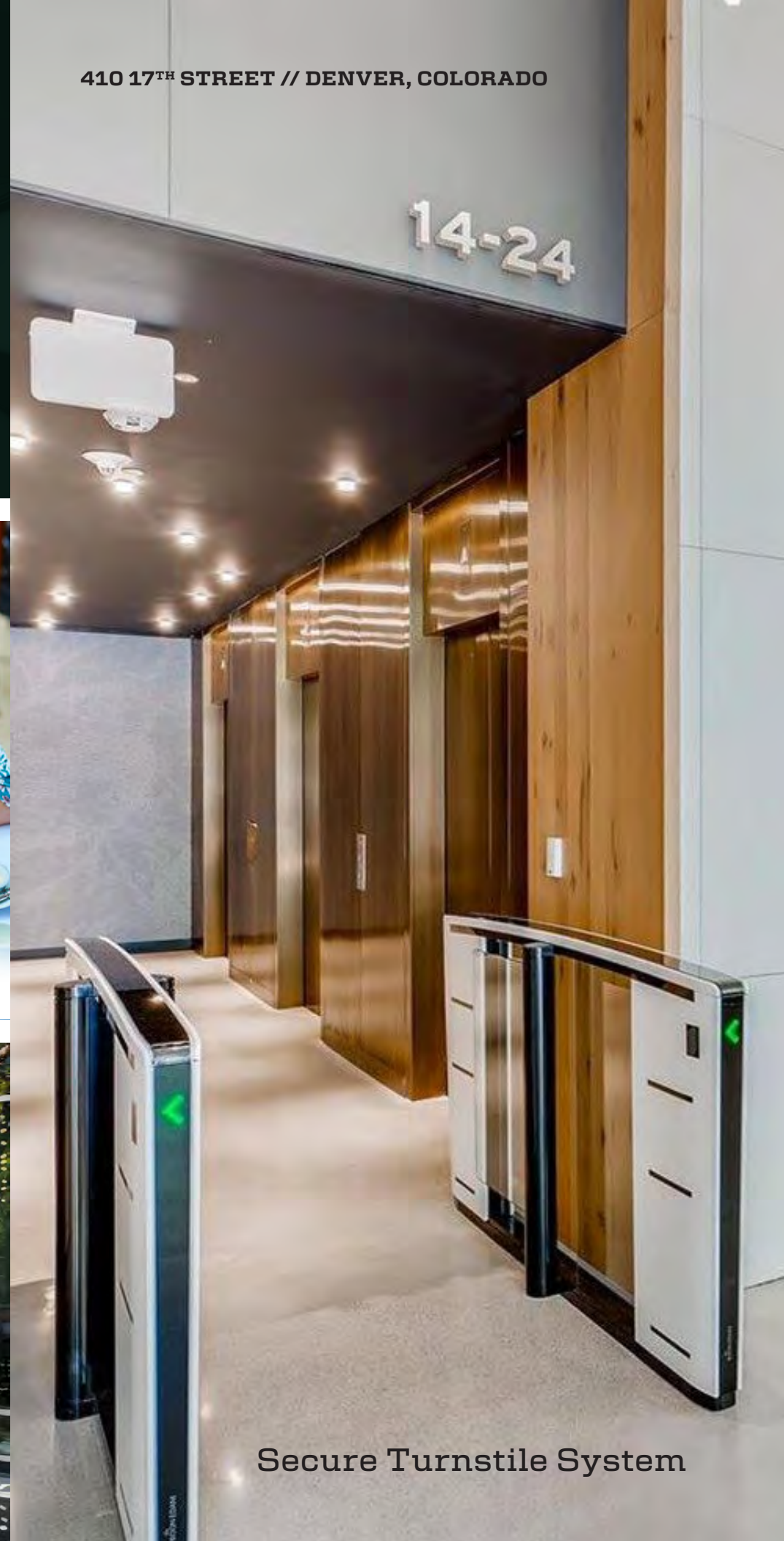
Secure Turnstile System