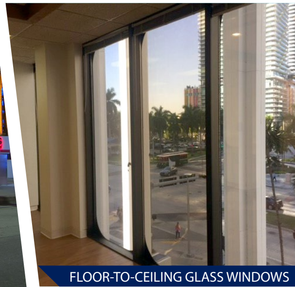
FLOOR-TO-CEILING GLASS WINDOWS