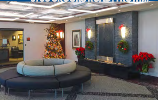
5700 CROOKS ROAD | TROY, MI