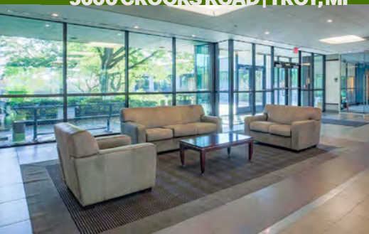
5600 CROOKS ROAD | TROY, MI