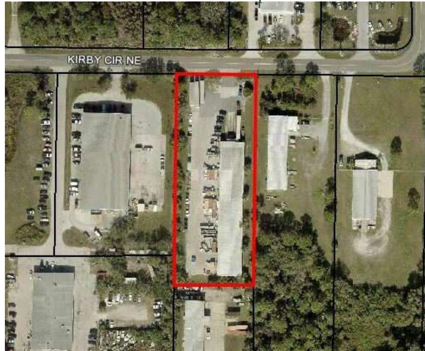
Aerial & Floorplan

2640 Kirby Circle NE, Palm Bay, FL 32905