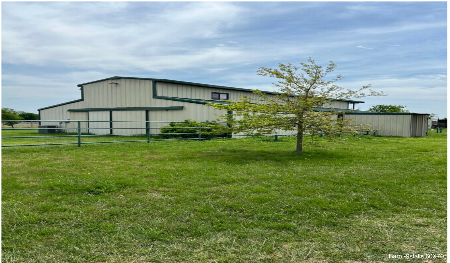
Barn -9stalls 60X70