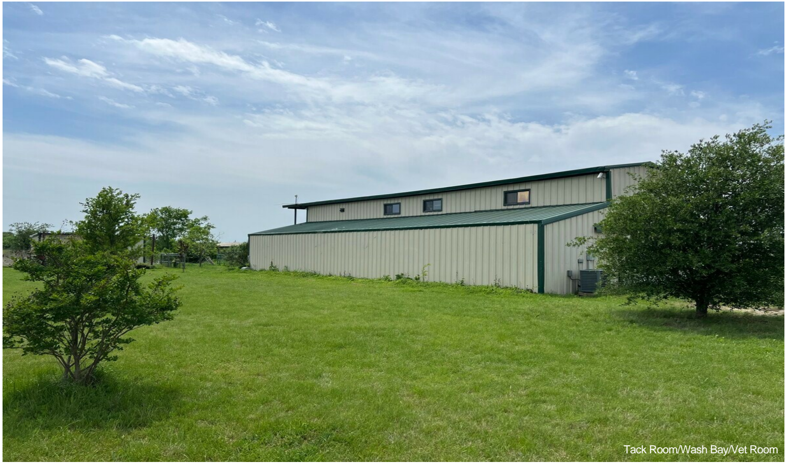
Tack Room/Wash Bay/Vet Room