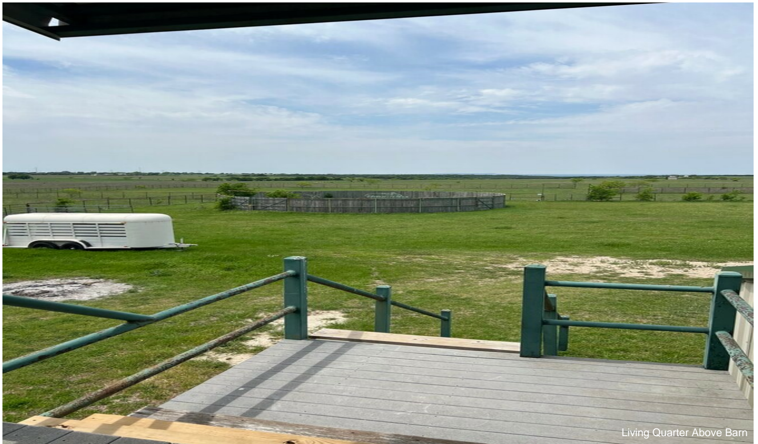
Living Quarter Above Barn