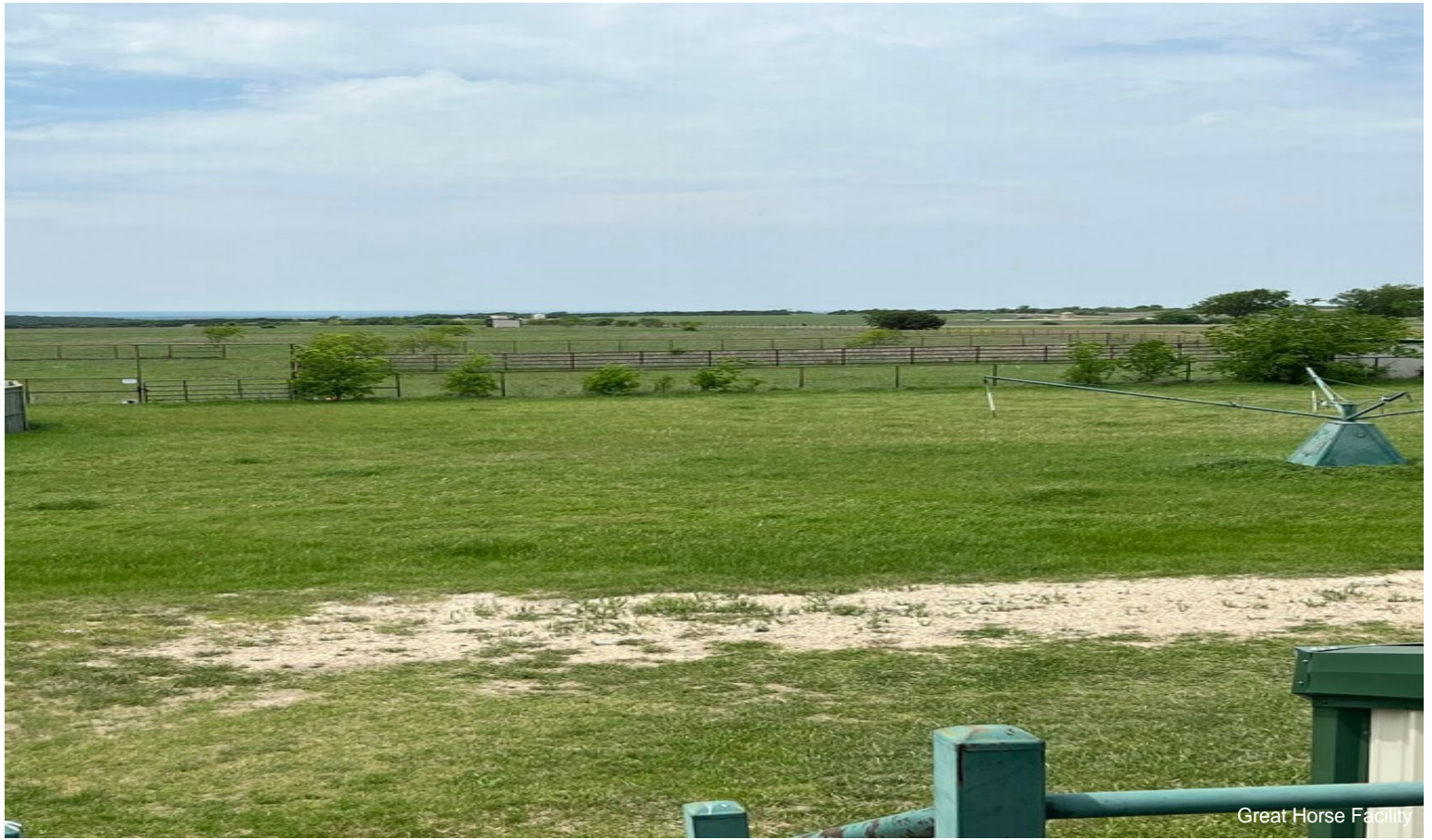
Great Horse Facility