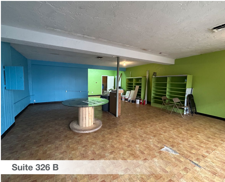
Suite 326 B