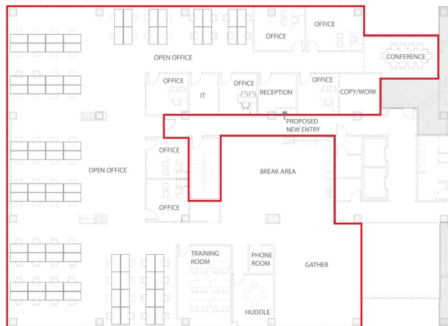
OPTION C 10,328 SF