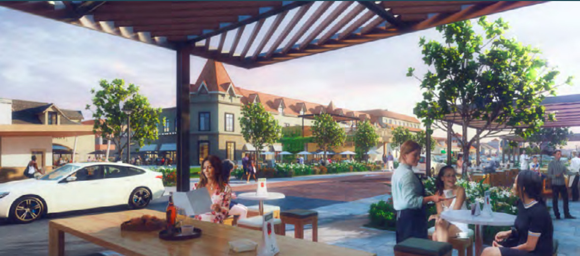
THE FORUM - RECENTLY REDEVELOPED CLICK TO LEARN MORE