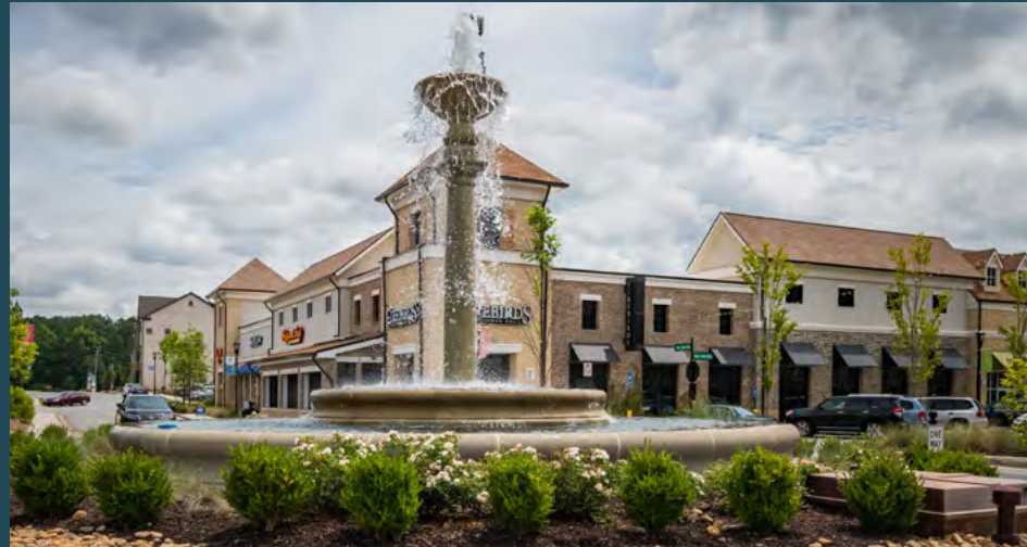
PEACHTREE CORNERS TOWN CENTER