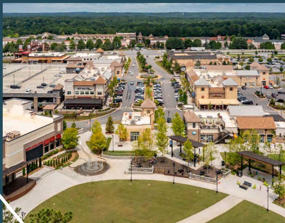
PEACHTREE CORNERS TOWN GREEN