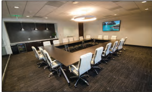
BUILDING CONFERENCE ROOM