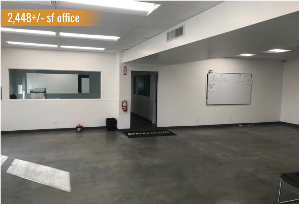
2,448+/- sf office