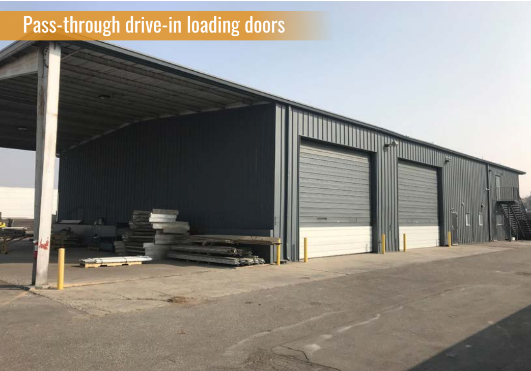
Pass-through drive-in loading doors