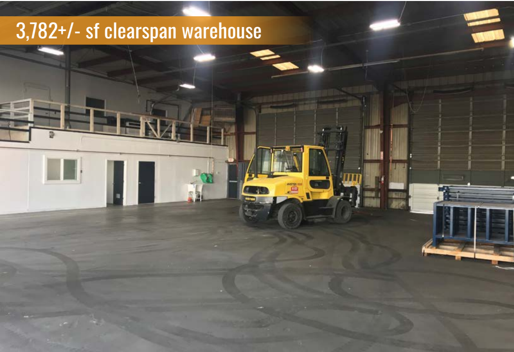
3,782+/- sf clearspan warehouse