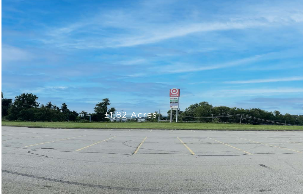
Retail / Restaurant Outparcels