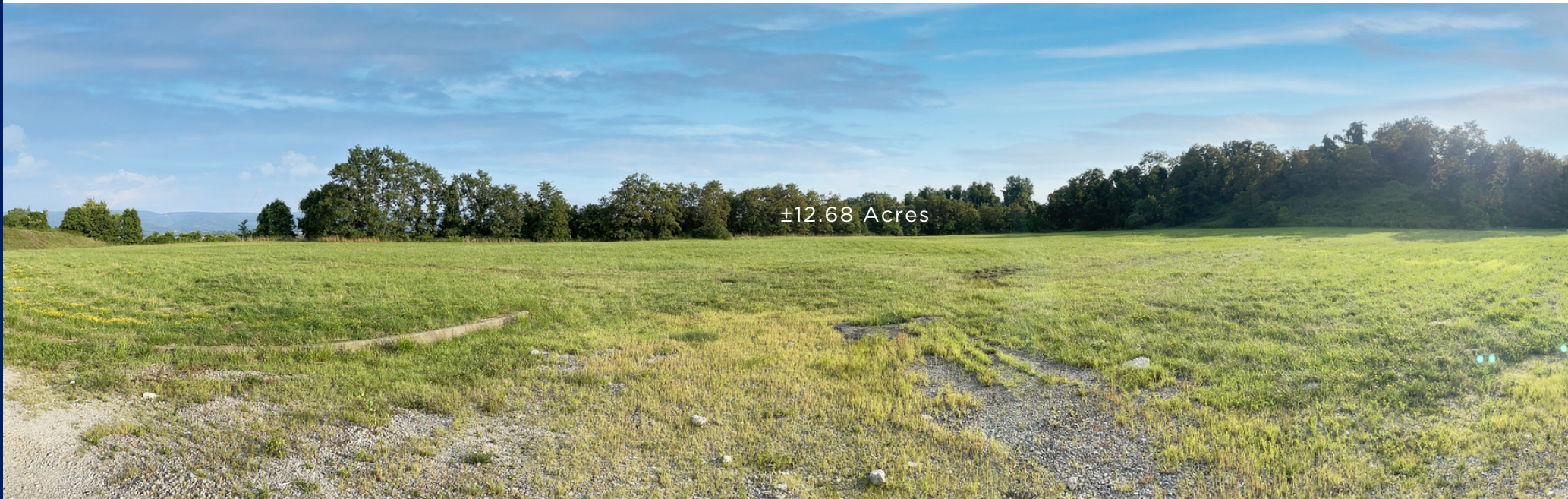
Large parcel that could accommodate retail, restaurant, hospitality, or medical uses