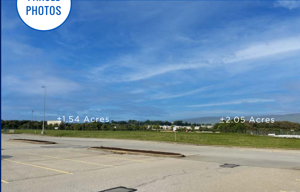
Retail / Restaurant Outparcels

116 MATTHEW DRIVE • 1.54 - 12.68 ACRES AVAILABLE • LAND