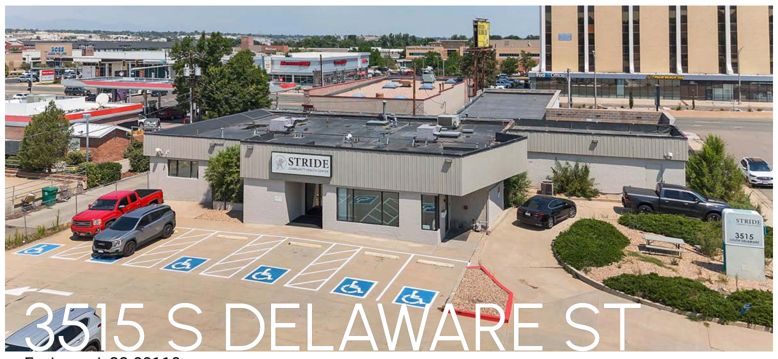
Englewood, CO 80110