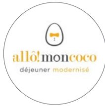
Allô! Mon Coco