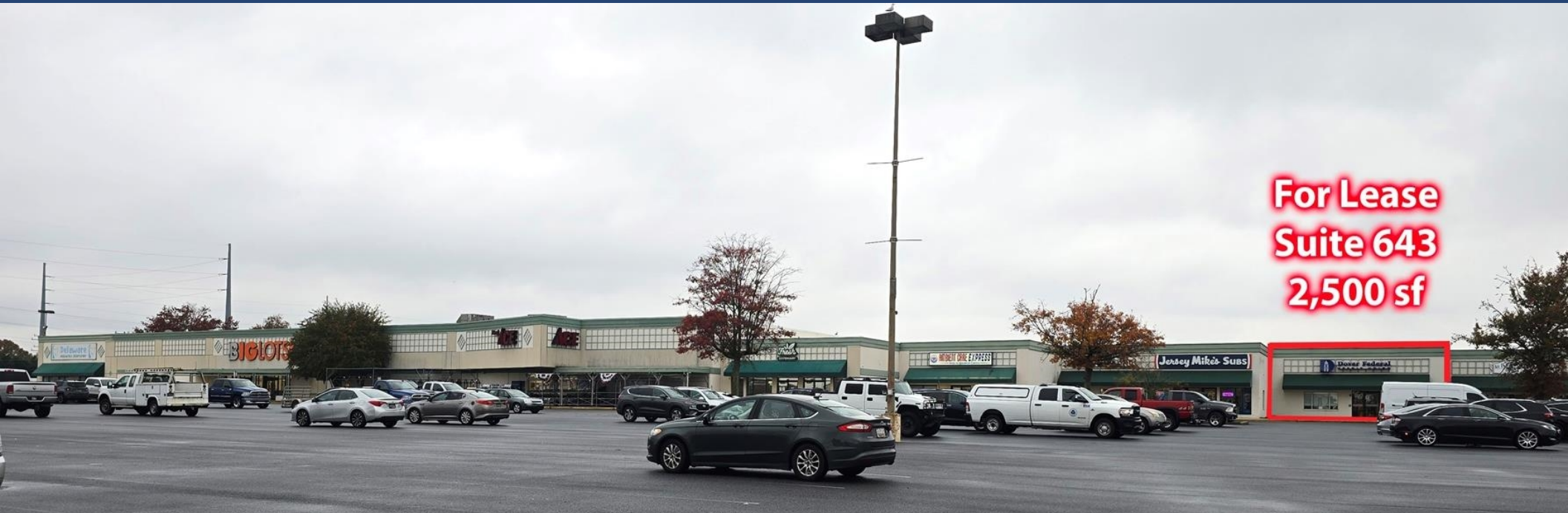
Suite 643 Next to Jersey Mike's