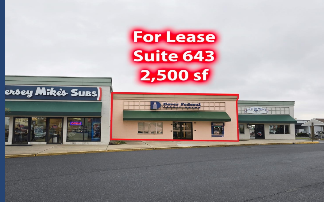
Suite 643 - 2,500sf - $18 NNN