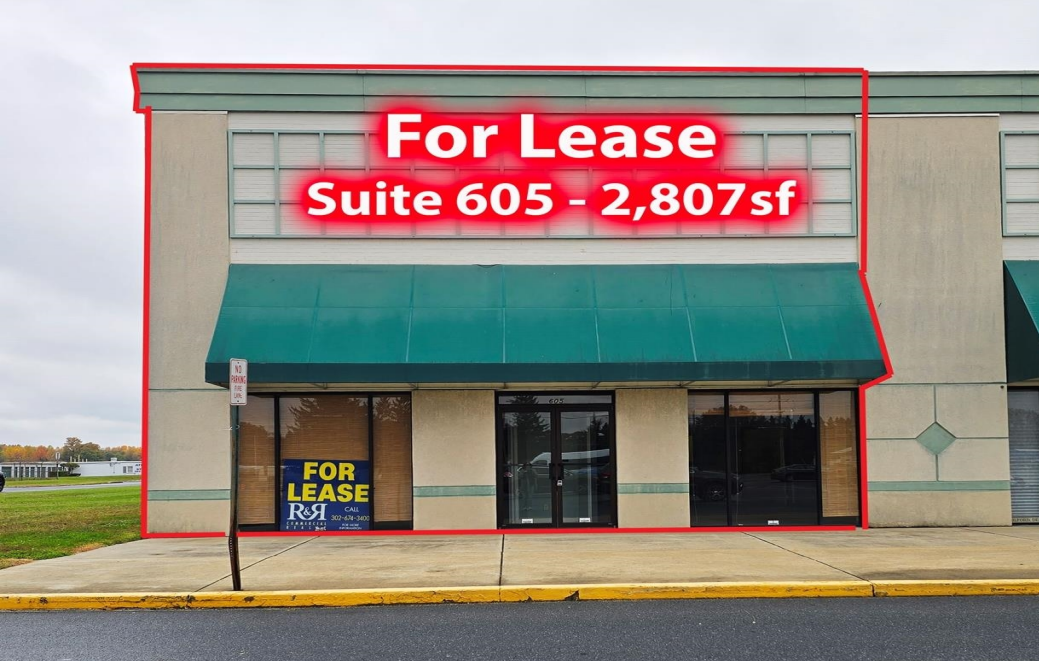
Suite 605 - 2,807sf - $16 NNN