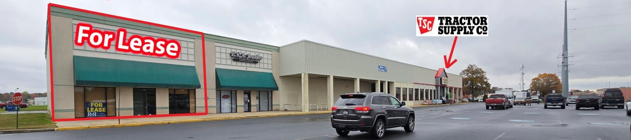
Suite 605 Next to Tractor Supply