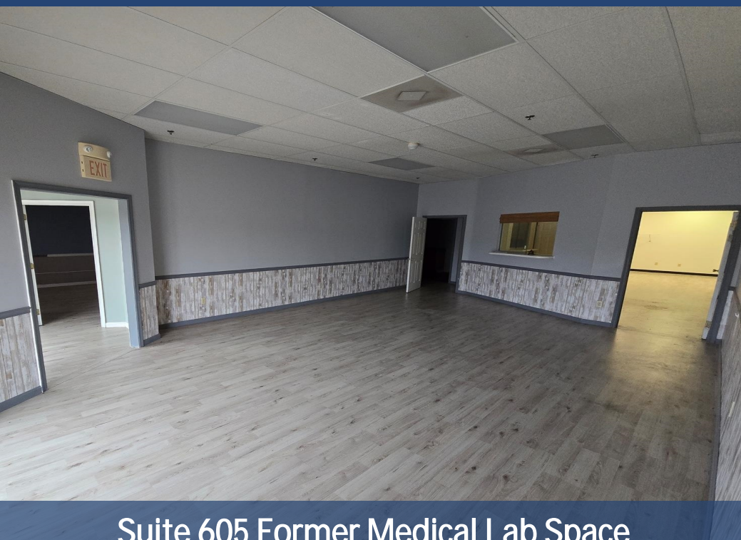
Suite 605 Former Medical Lab Space