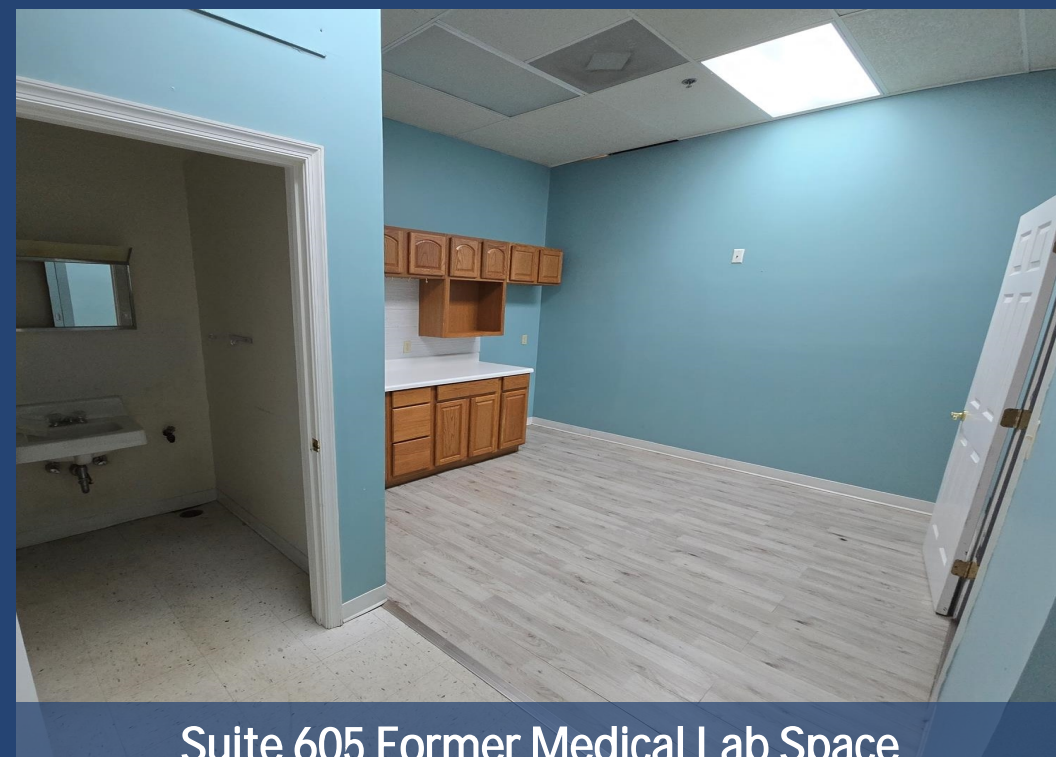
Suite 605 Former Medical Lab Space