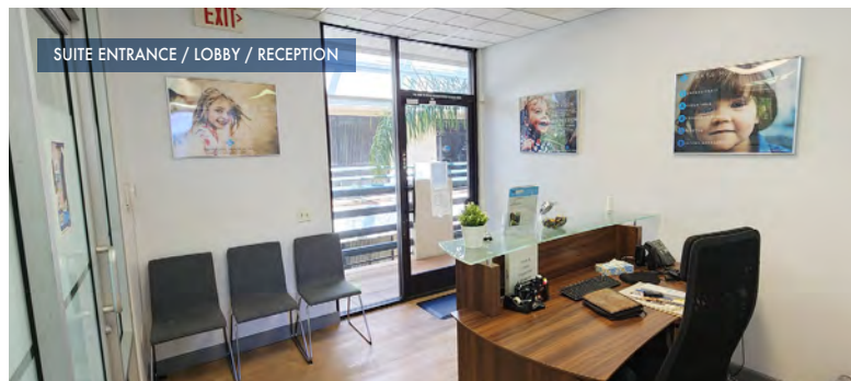
SUITE ENTRANCE / LOBBY / RECEPTION