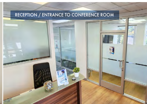
RECEPTION / ENTRANCE TO CONFERENCE ROOM