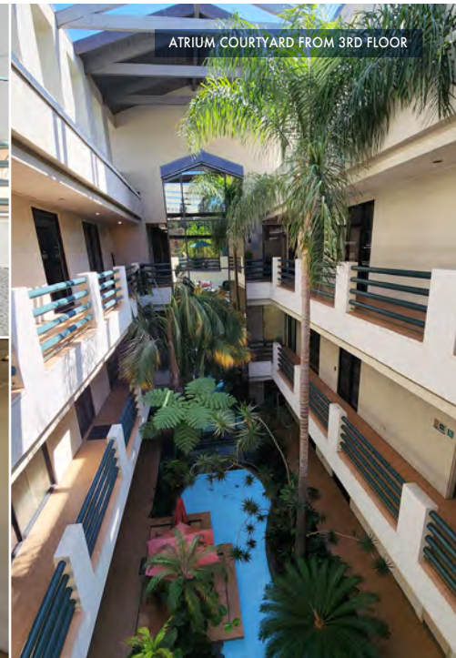
ATRIUM COURTYARD FROM 3RD FLOOR