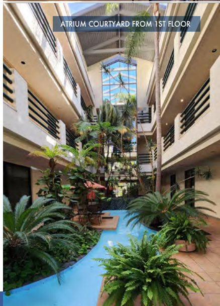
ATRIUM COURTYARD FROM 1ST FLOOR