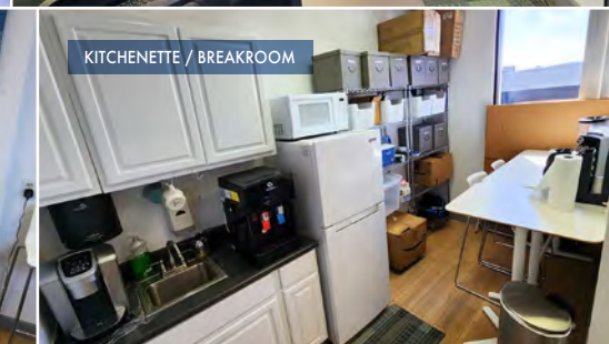
KITCHENETTE / BREAKROOM

±1,159 SF THIRD-FLOOR MEDICAL / CREATIVE OFFICE SUITE