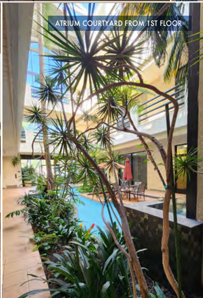
ATRIUM COURTYARD FROM 1ST FLOOR