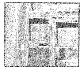
AERIAL PHOTOGRAPH NOT TO SCALE

1. THE NORTH AND EAST BUILDING WALLS ARE ± ON THE NORTH AND EAST PROPERTY LINES. 2. CONCRETE CURBS (0.5' OF THE WEST AND EAST PROPERTY LINES) AS SHOWN. 3. THERE IS A TRENCH AND 900' OF 12" SOUTHERN PIPE ALONG THE EAST AND SOUTH PROPERTY LINES. 4. THE LANDS HEREIN NOT DETERMINED.