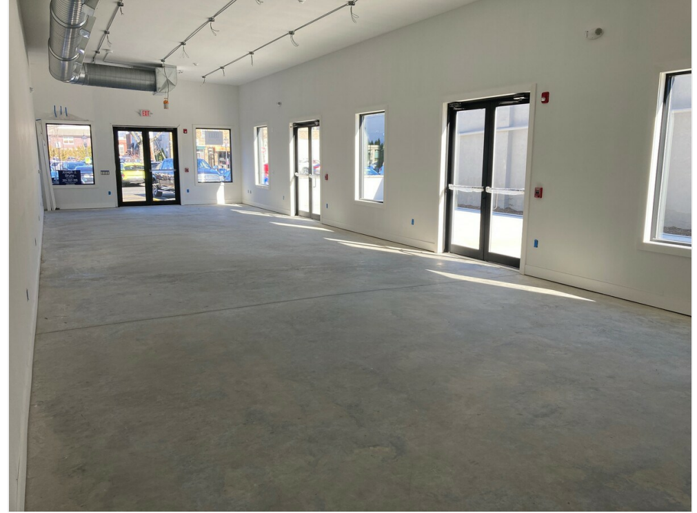
Center Ave Entrance New Construction