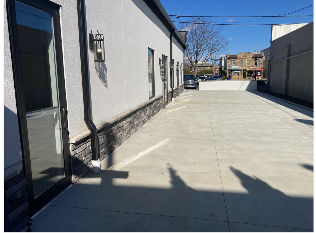
Side Courtyard - Center Ave Entrance - New Construction