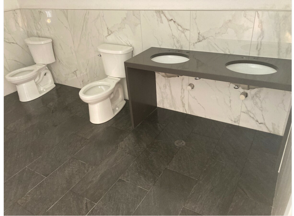
Ladies Room - Center Ave Entrance & Patio New Construction