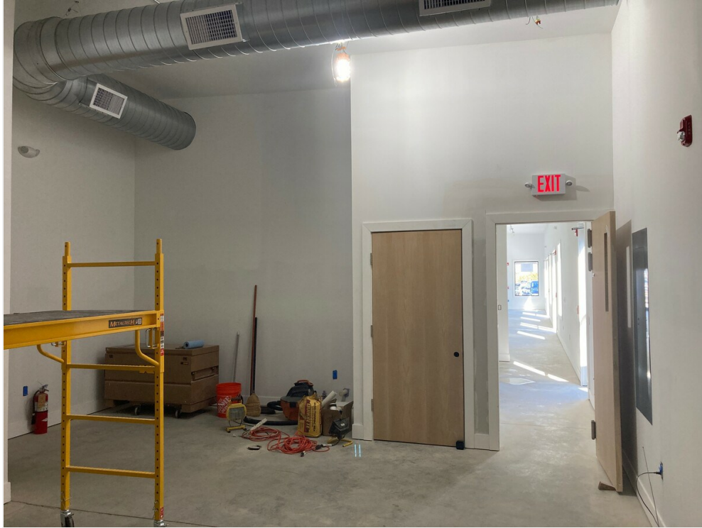
Center Ave Entrance & Patio New Construction