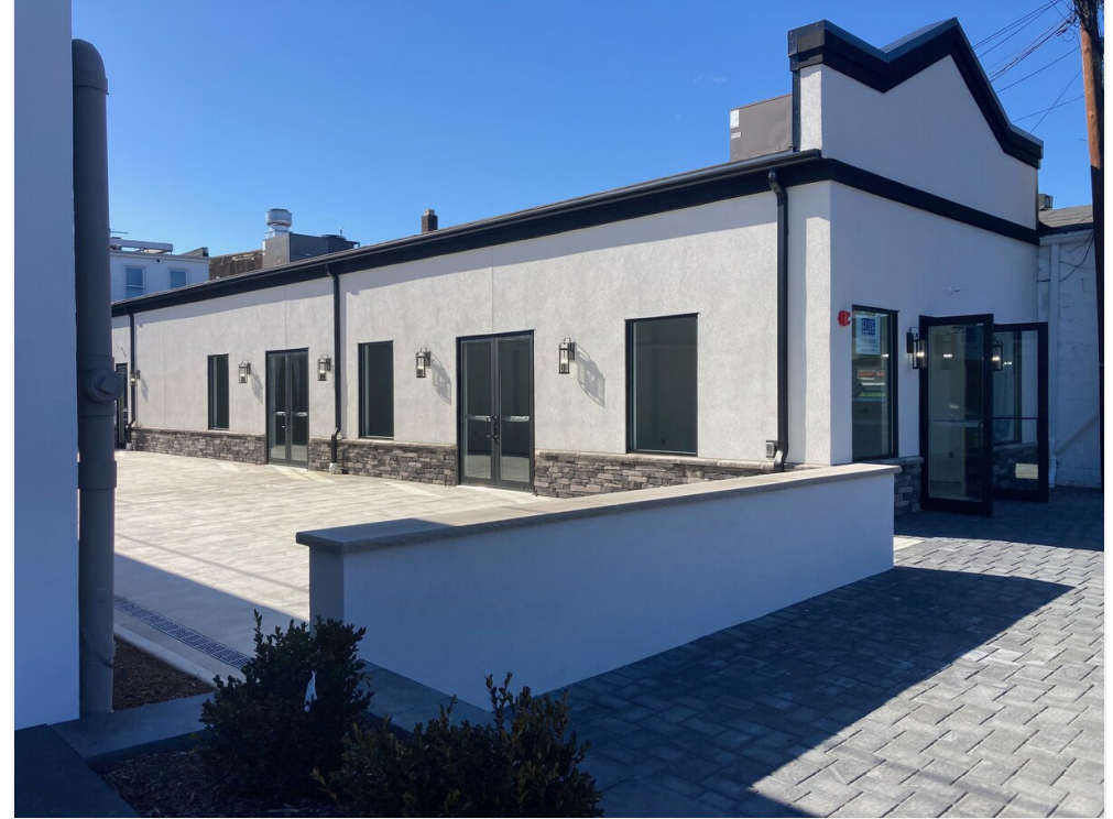
Front Patio & Side Courtyard - Center Ave Entrance - New Construction