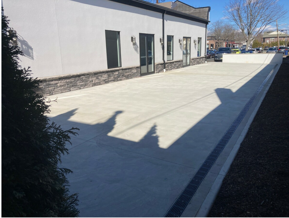
Side Courtyard - Center Ave Entrance - New Construction