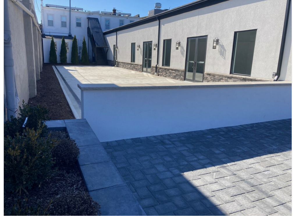
Front Patio & Side Courtyard - Center Ave Entrance - New Construction