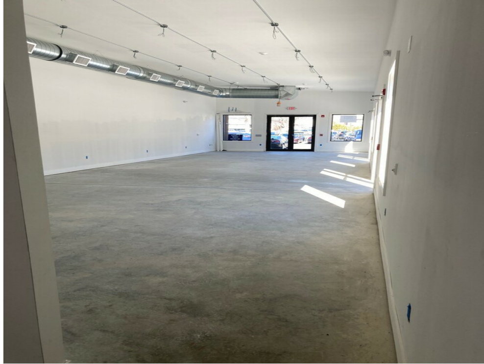
Center Ave Entrance New Construction