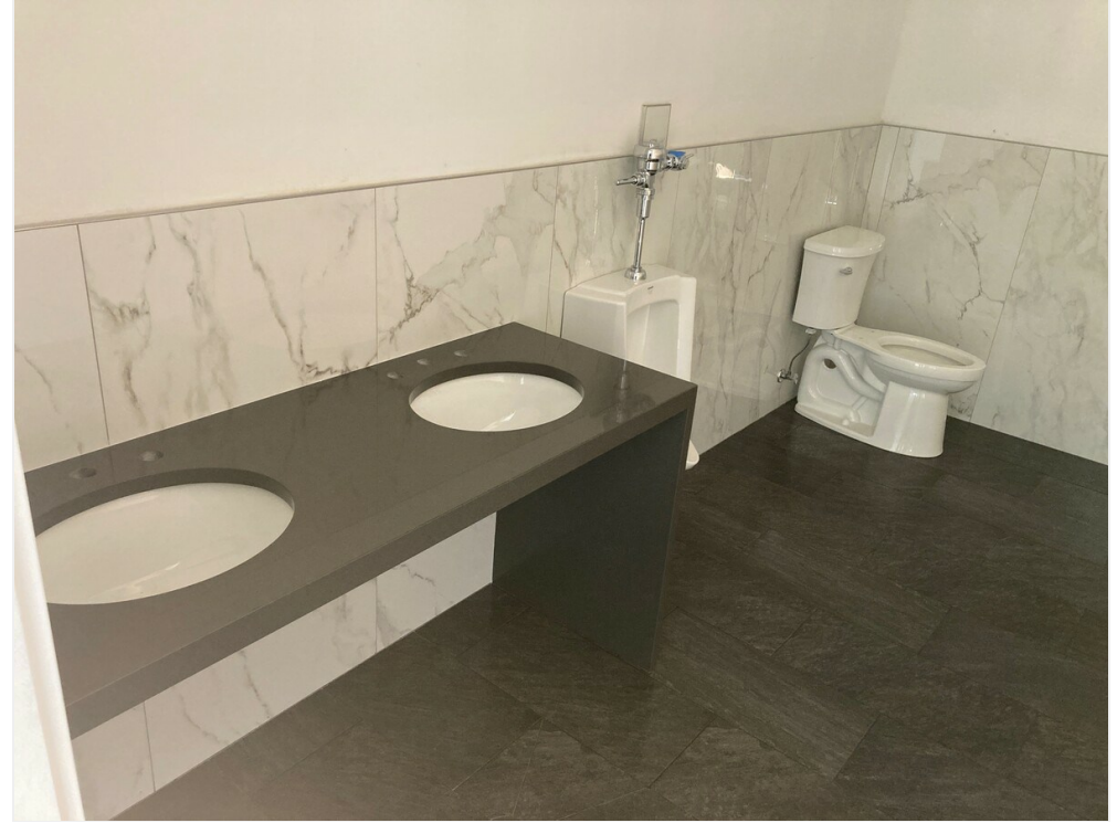
Mens Room - Center Ave Entrance & Patio New Construction