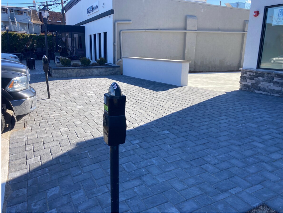
Front Patio - Center Ave Entrance - New Construction