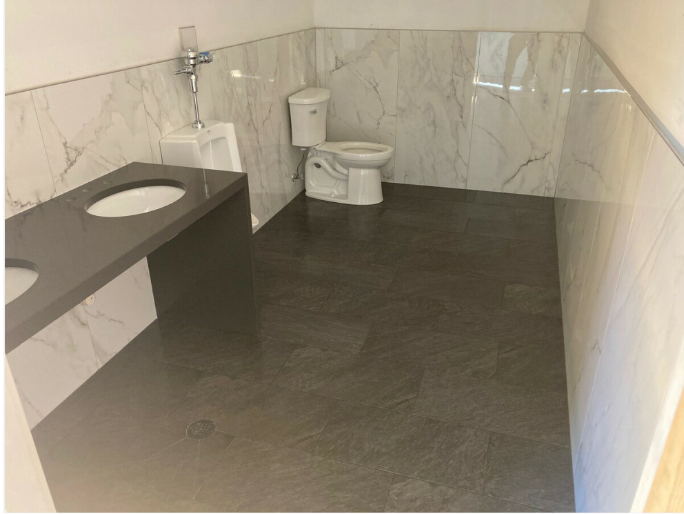
Mens Room - Center Ave Entrance & Patio New Construction