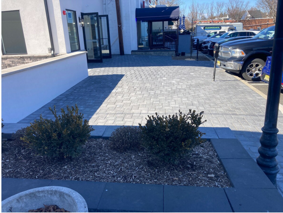
Front Patio - Center Ave Entrance - New Construction