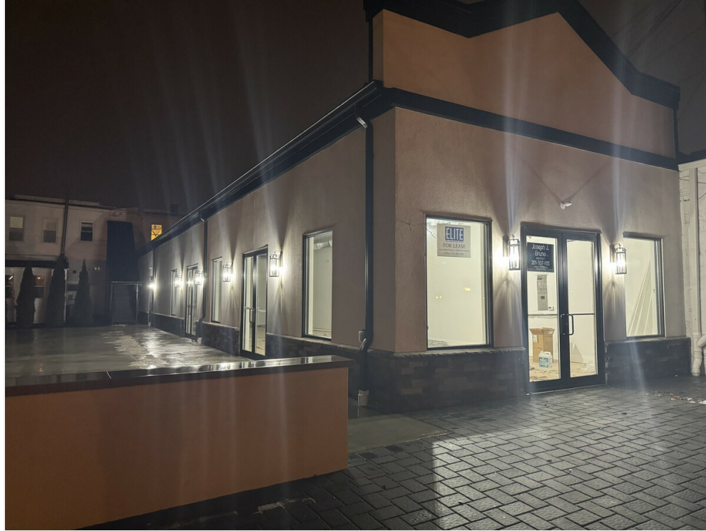
Front Patio & Side Courtyard - Center Ave Entrance - New Construction