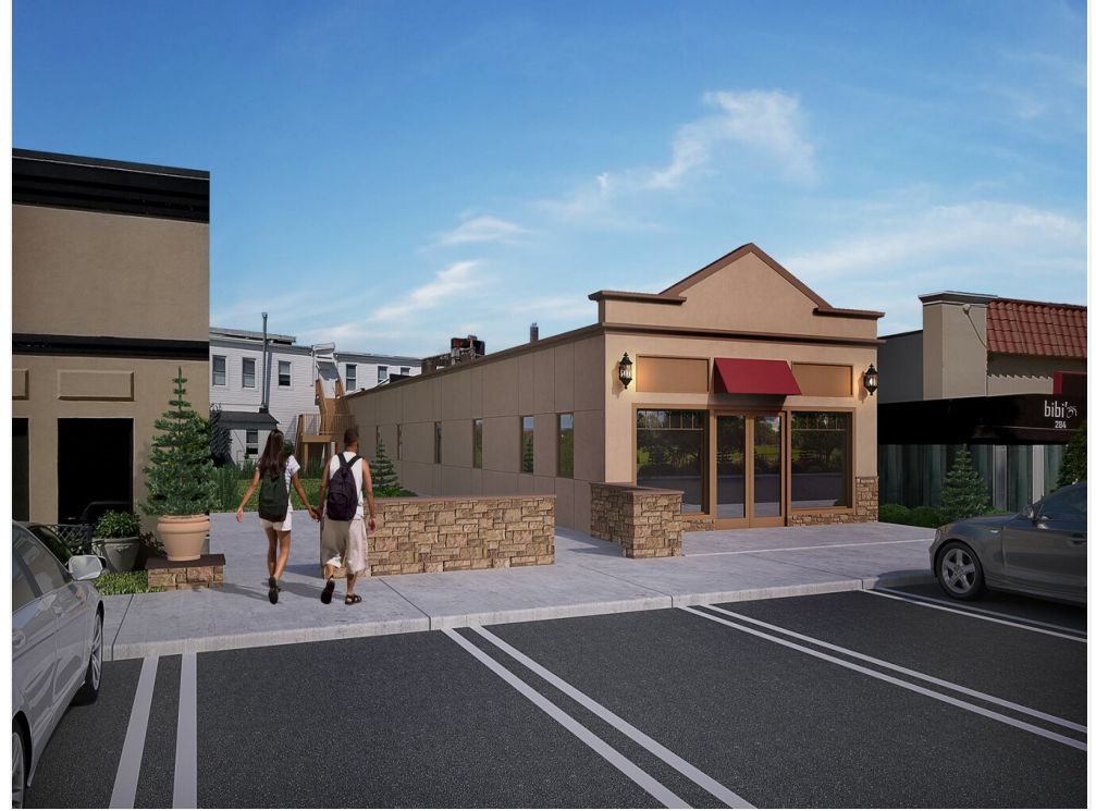
3D image Center Ave Entrance & Patio