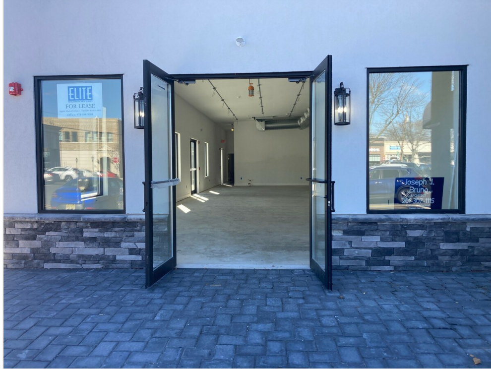
Center Ave Entrance & Patio New Construction