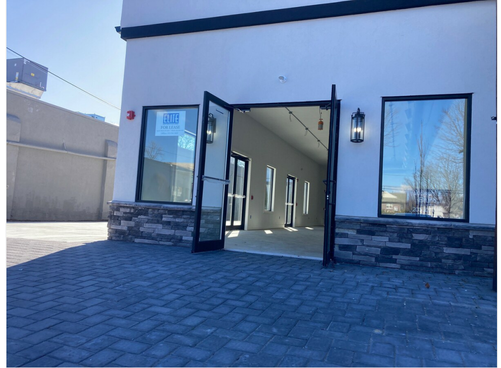
Center Ave Entrance & Patio New Construction