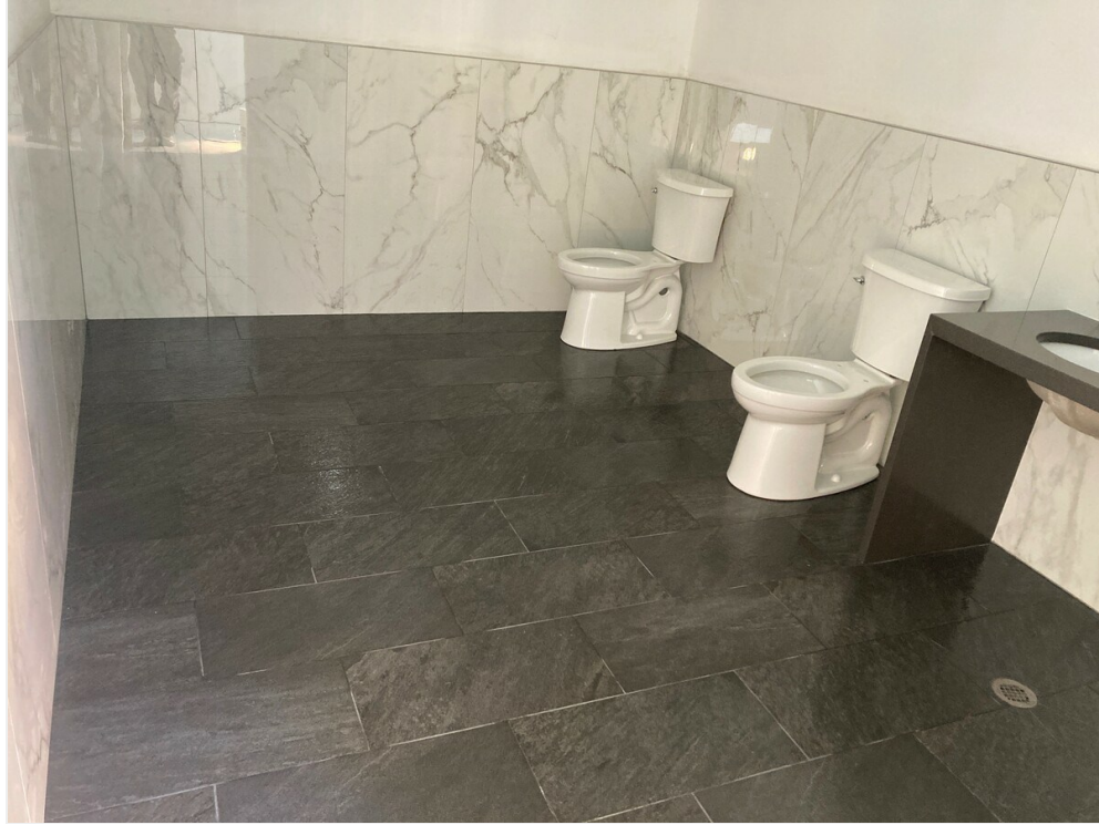
Ladies Room - Center Ave Entrance & Patio New Construction