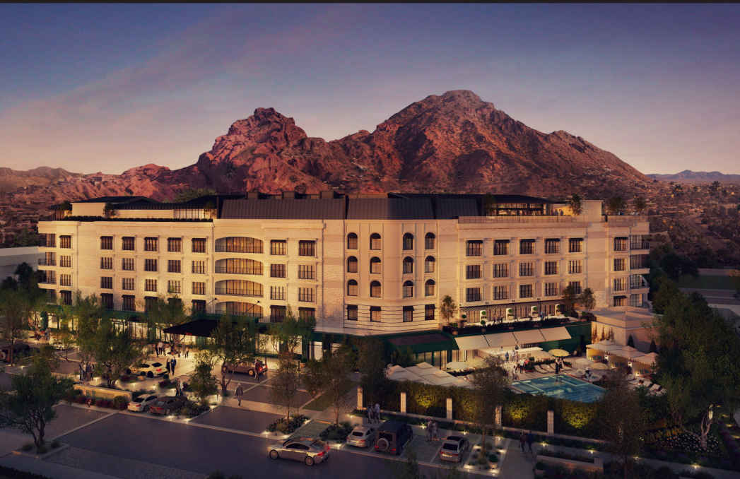
THE GLOBAL AMBASSADOR HOTEL