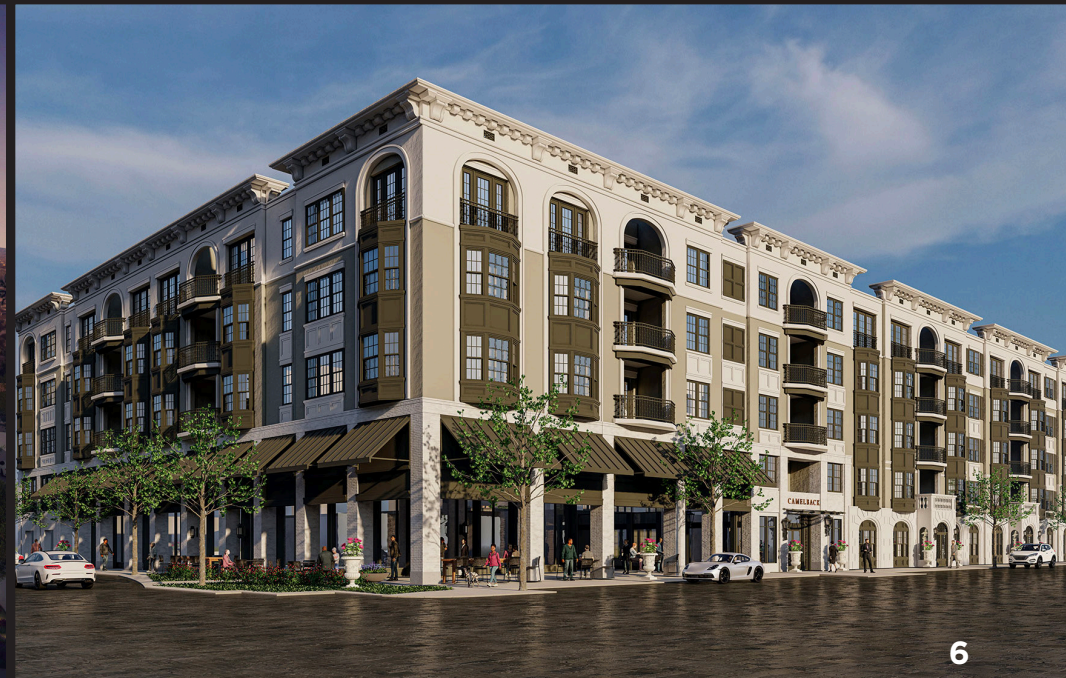
THE GROVE APARTMENTS