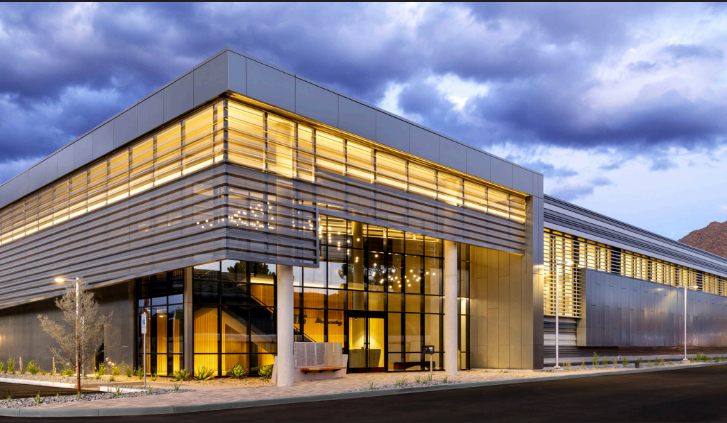
PHOENIX SUNS 5G PERFORMANCE CENTER