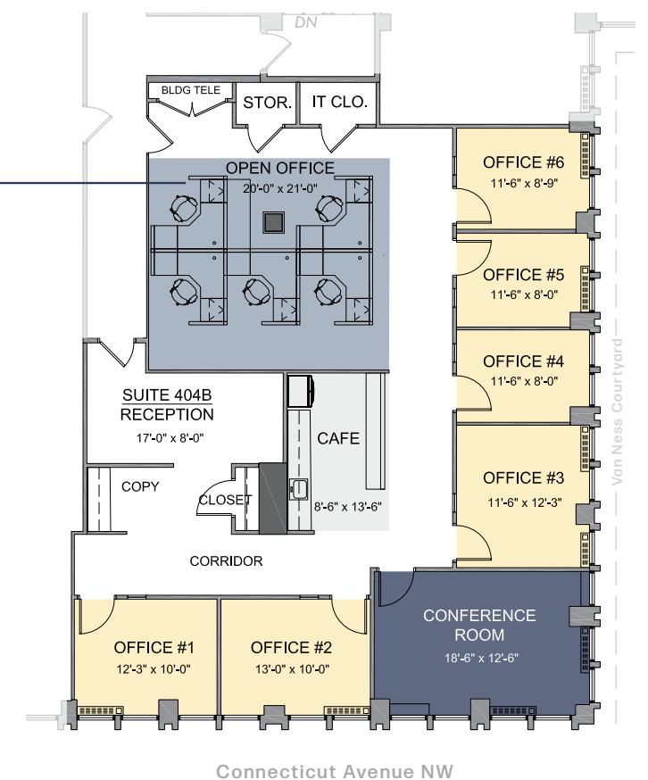
Suite 404 B 2,812 SF