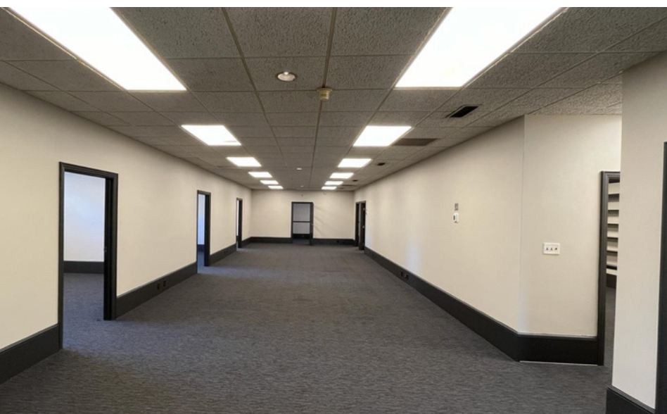
Open Work Space