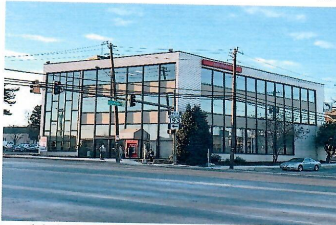
Remodeled "Bank of America Building" on University Blvd.

Price: $2,510 per month. Only $19.90 p.s.f., full service, tenant cleans its own space and landlord cleans common areas.