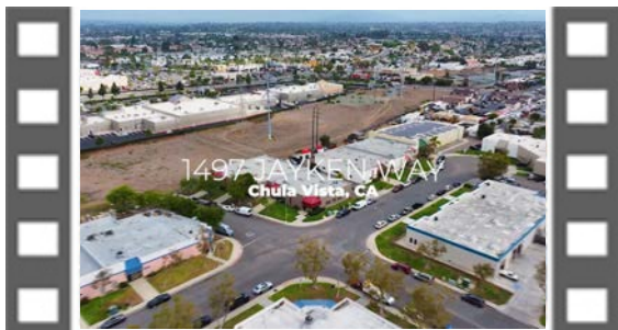
CLICK IMAGE TO TAKE A VIRTUAL TOUR