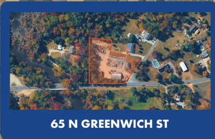
65 N GREENWICH ST