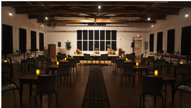
The Packing House 3,500 SF Performance Venue & Event Space