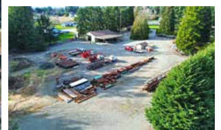
FENCED CONTRACTOR YARD