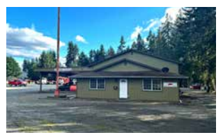
SHOP & OFFICE BUILDING