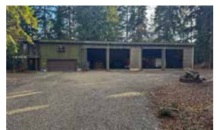
OPEN VEHICLE STORAGE BUILDING